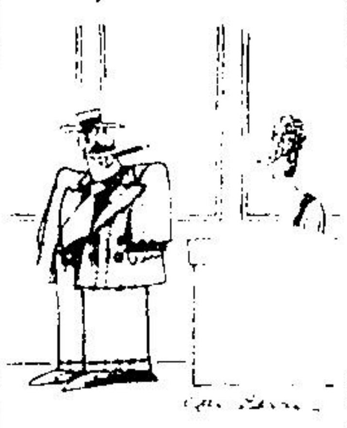
ILLUSTRATION BY [Name]