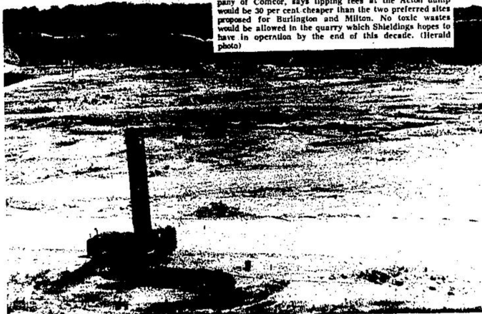
The controversial limestone quarry in Acton seen here is big enough to hold more than 15 tonnes of garbage. United Aggregates, the owner of the quarry, has joined with Comcor Waste Management in a proposal to turn it into a dump. Shieldings Incorporated, the parent company of Comcor, says tipping fees at the Acton dump would be 30 per cent cheaper than the two preferred sites proposed for Burlington and Milton. No toxic wastes would be allowed in the quarry which Shieldings hopes to have in operation by the end of this decade.