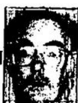
By ALEX TORGIL Herald Special

I believe it is important for the district to show up in as large numbers as possible, and the other hosting districts also. FIFA will be present and watching our organization of a world class tournament, even although the players are young. The possibility of looking at