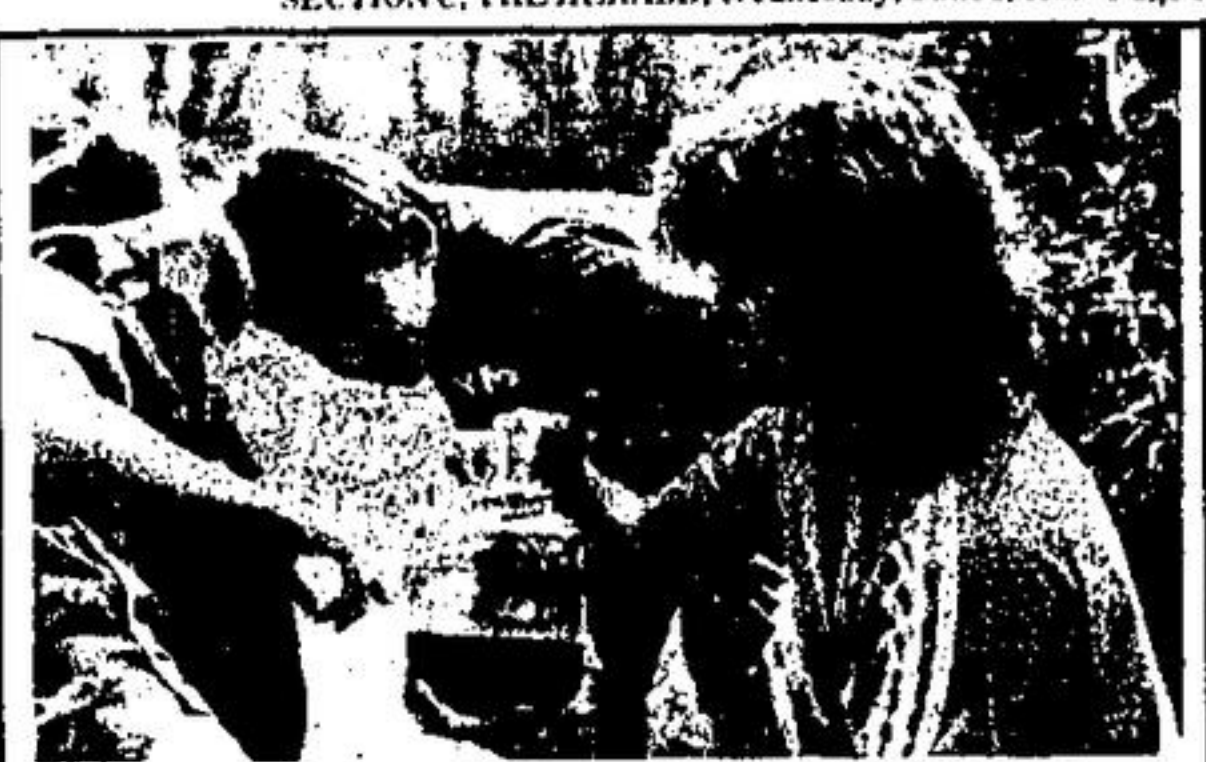
The YMCA's Adventure in Nature Camp is just one popular camp that is available to boys and girls, aged 8 - 14 years at Kelo Conservation area. Other YMCA Day Camps include Sports, Gymnastics, Creative Arts, Computer, Riding, Sailing and Day and Kinder Camps. Bussing is provided to all camps. Call 877-6163 or 853-1070 to reserve a spot for your child.