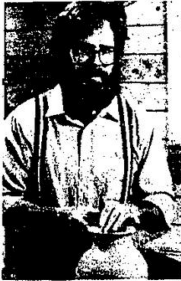
Come spin some time with Prince Edward Island artisans and learn how a hunk of clay or a bagful of sheep's wool are turned into exquisite crafts. Pride of workmanship, handed down through the generations, still thrives on the Island. The continuing popularity of the traditional crafts of hand-thrown pottery, quilting, knitting and weaving delight visitors from around the world. As well, crafts of a more recent vintage such as woodwork and silver jewelry are growing in popularity. Many Island artisans give demonstrations in their studios.

Your previous passport (if you had one) isn't regarded as proof of Canadian citizenship when it comes to issuing a new document. Your application must be accompanied by your birth certificate or citizenship certificate if you were born in Canada, or by a citizenship certificate, certificate of naturalization or similar official document if you were born in another country.