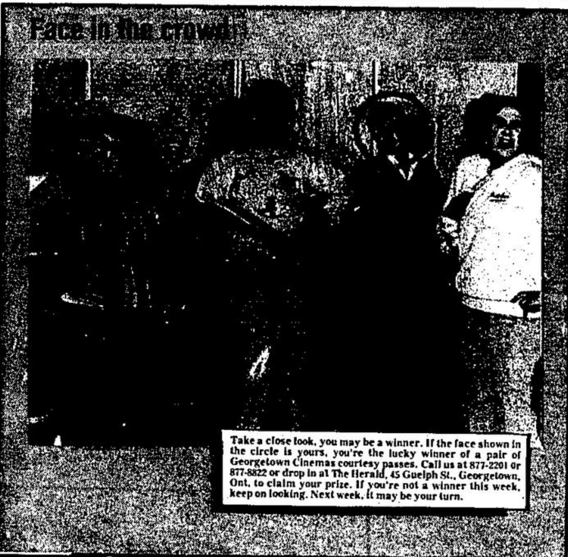
Take a close look, you may be a winner. If the face shown in the circle is yours, you're the lucky winner of a pair of Georgetown Cinemas courtesy passes. Call us at 877-2201 or 877-8822 or drop in at The Herald, 45 Guelph St., Georgetown, Ont. to claim your prize. If you're not a winner this week, keep on looking. Next week, it may be your turn.

subject of computers that much of the literature lacks. Instead of a sociological tract or computer manual, we are given a marvelous collection of essays. For that he can be forgiven comparing the Apple Macintosh with the apple that tempted Eve of the one that suggested the practical effects of gravity to Isaac Newton.