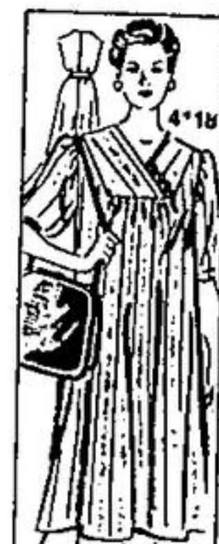
4118—Half sizes 12½ to 26½. Feminine float in two sleeve lengths. Belt or not. Size 14½ takes 2 yds. 60 in.