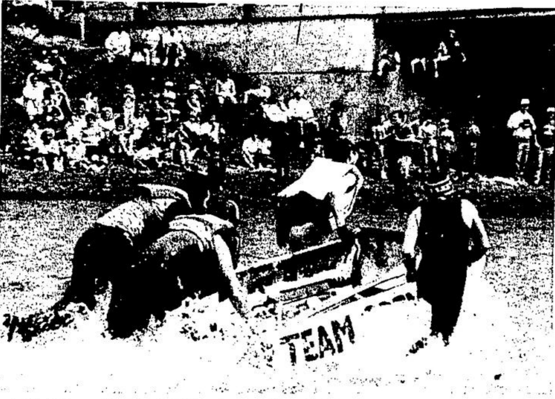
The finish of Saturday's Crazy Boat Race proved to be tricky for most as the low water level made for a rocky ride. Many seafarers, like these hearty souls, had to abandon their crafts and cross the line under the bridge under old fashioned man-power.