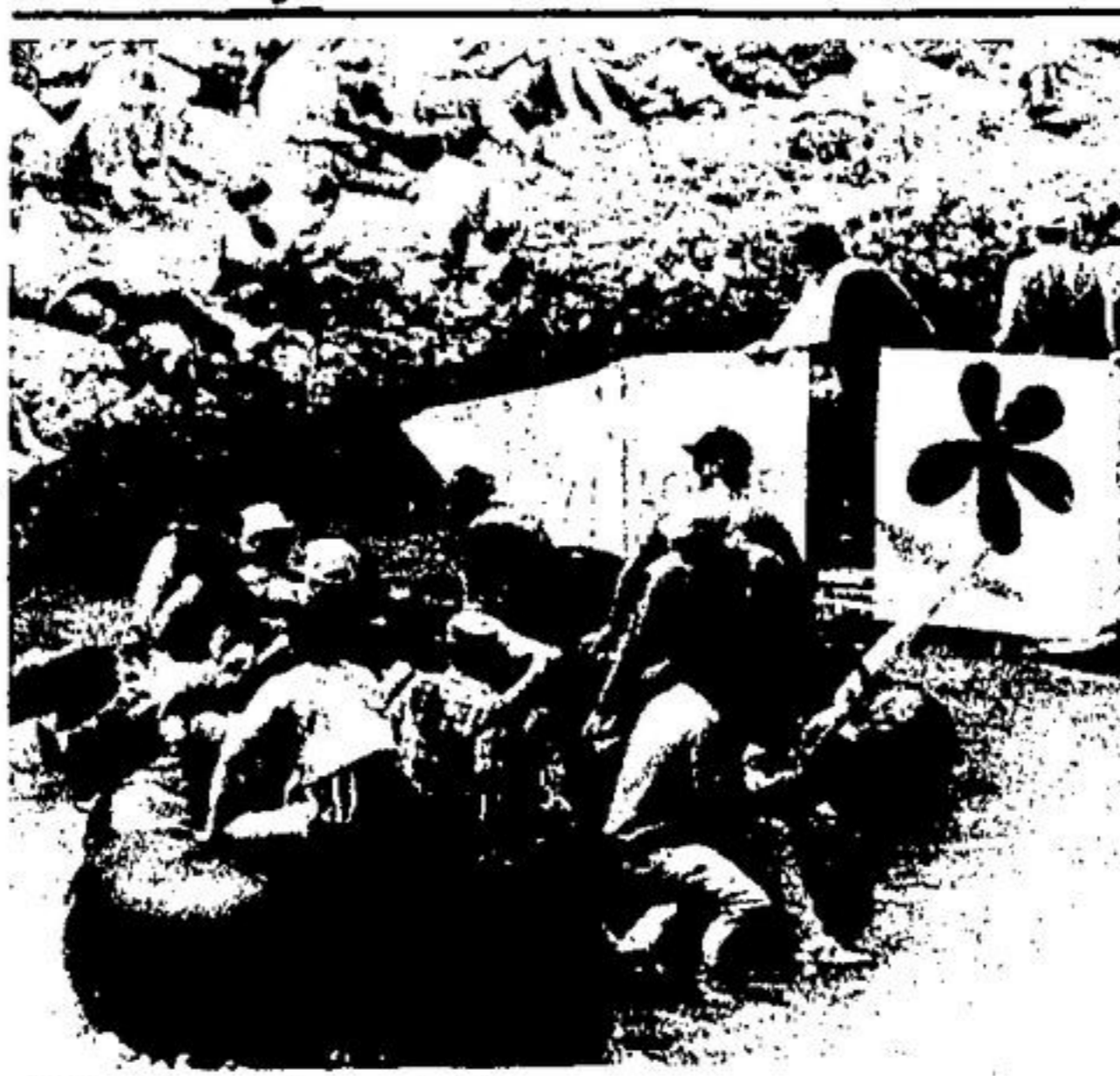
Taking it easy at the end of the race is the crew of this huge rubber craft which is being guided to shore by its able crew. The race route was crammed with amused spectators Saturday as the weather allowed for a clear vision of the entire race.