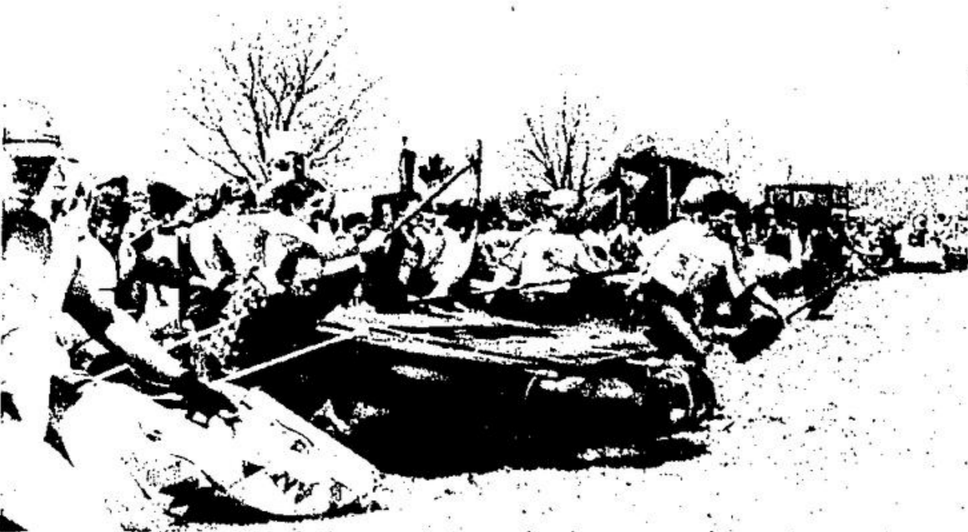
The start of the Crazy Boat Race lived up to its name Saturday as the entrants poured into the Credit River at the sound of the gun blast. The race featured a variety of boats - many of which didn't quite make it in one piece to the finish line. A large crowd was on hand both at the start and the finish to take in the annual event. The water level wasn't too high and many boats had to be pushed through some shallow water.