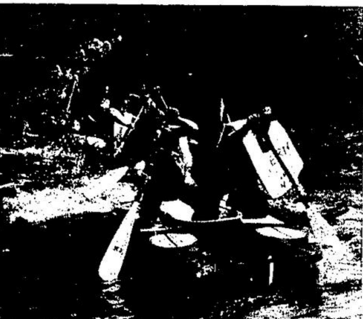
Paddling for their life these Crazy Boat Race entrants are attempting to keep their craft on track shortly after the start of the race Saturday. The entrants featured a variety of crafts ranging from a huge spider, to a scaled down version of an old train engine to a biting alligator boat.