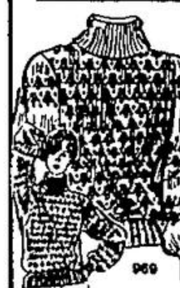
969—Knit a striped turtle neck pullover of worsted weight yarn in 2 colors. Be a smash on the ski slopes. Directions Sizes 14-20 included.

FREE OFFER 3 Craft Books (value $8.85) when you order one of the $2.95 books listed below. 111—Happen Crochet 115—Easy Ripple Crochet 117—Art of Needlepoint 135—Dolls and Clothes Add $1.00 for postage handling.