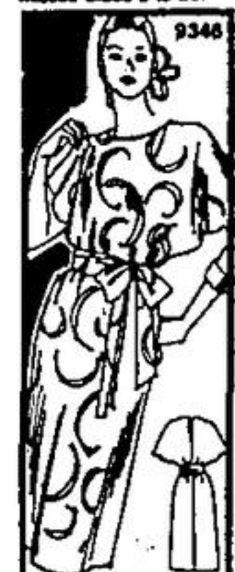
9348—Wide - winging sleeves narrow your waist, hips. Easy sew—three main parts, no waist seam. Use crepe. Misses Sizes 6 to 20.