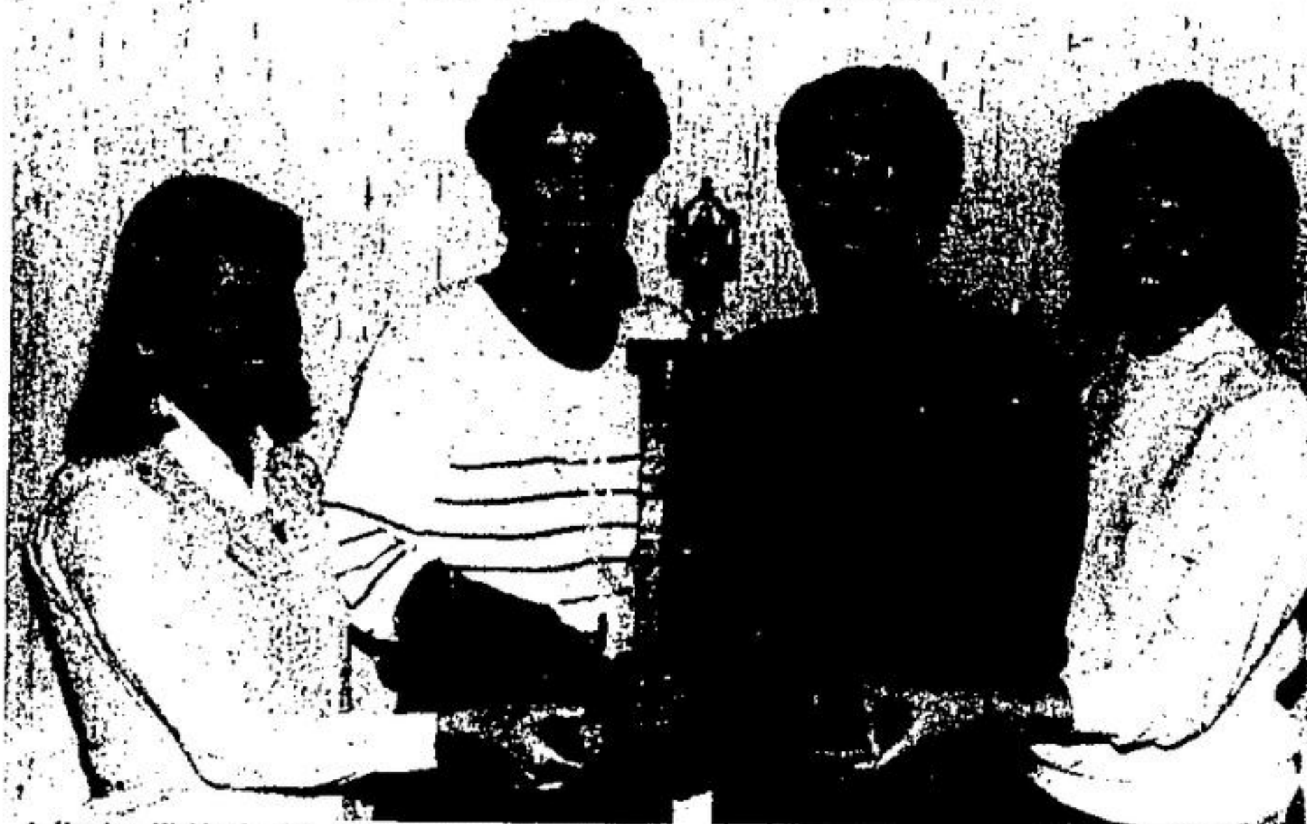
A Humber Highlands rink was the big winner at the annual Business Girls' Bouspiel hosted by the North Halton Ladies' Curling Club Saturday. The event was sponsored by Royal LePage Real Estate and Adams