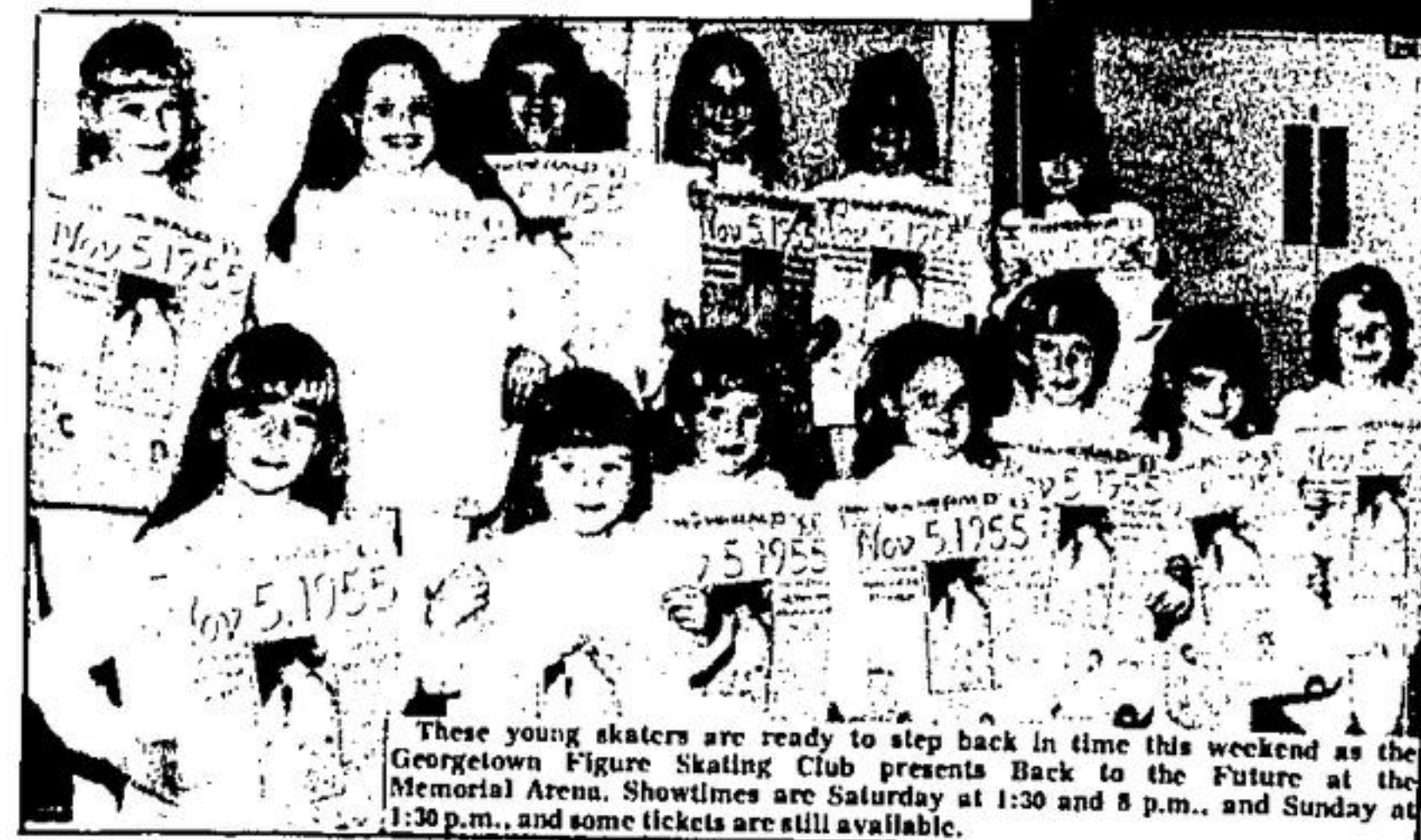
These young skaters are ready to step back in time this weekend as the Georgetown Figure Skating Club presents Back to the Future at the Memorial Arena. Showtimes are Saturday at 1:30 and 8 p.m., and Sunday at 1:30 p.m., and some tickets are still available.