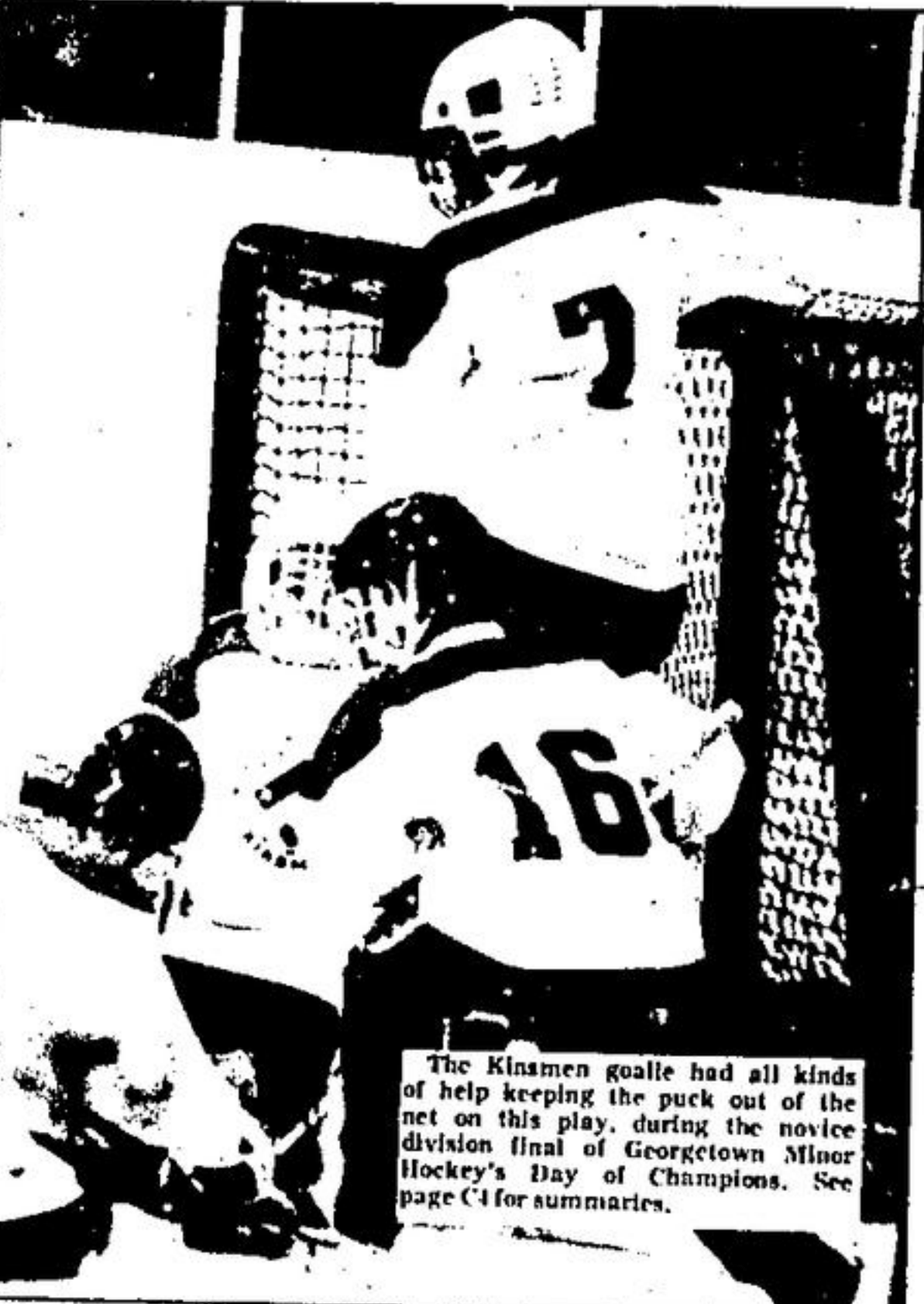
The Kinsmen goalie had all kinds of help keeping the puck out of the net on this play, during the novice division final of Georgetown Minor Hockey's Day of Champions. See page C4 for summaries.