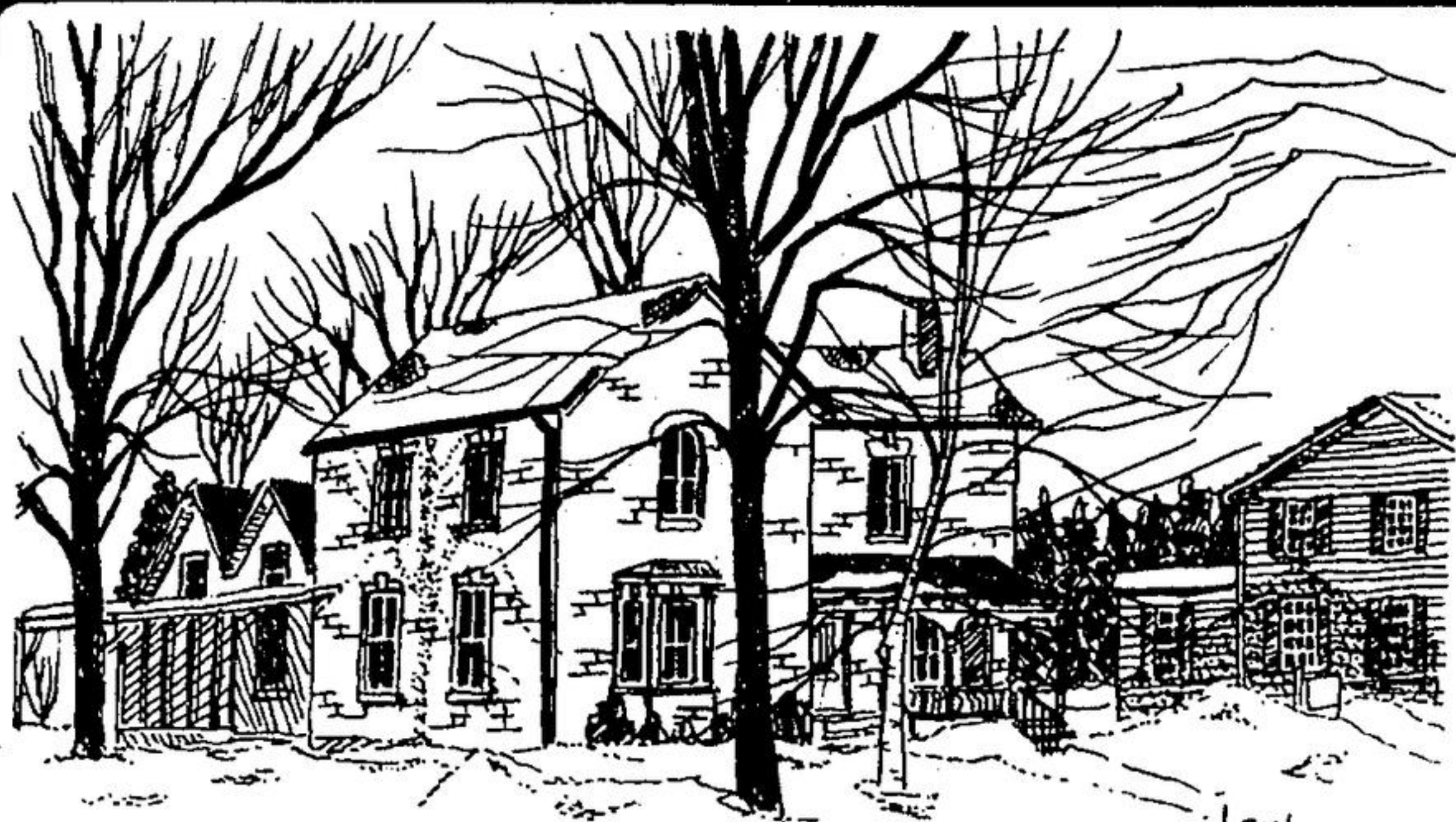
- 126 MAIN ST., SOUTH - - GEORGETOWN -