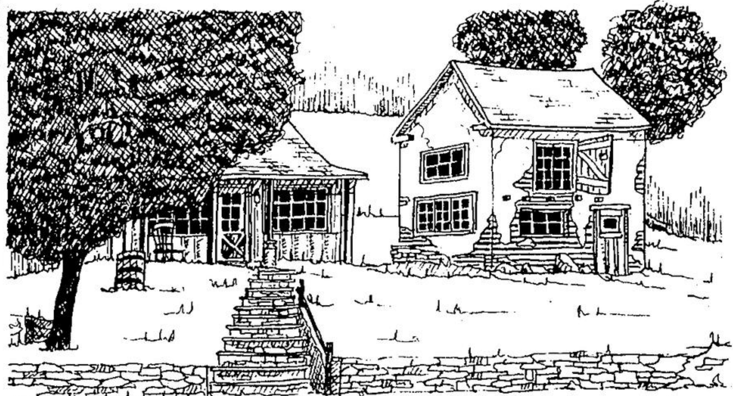
- GLEN GIFT SHOPPE - - GLEN WILLIAMS -

Over the past while, our writers have contacted some businesses in the area to profile what has been happening since a year ago. We've tried to focus on a number of different firms to provide an overview of the progress in the community.