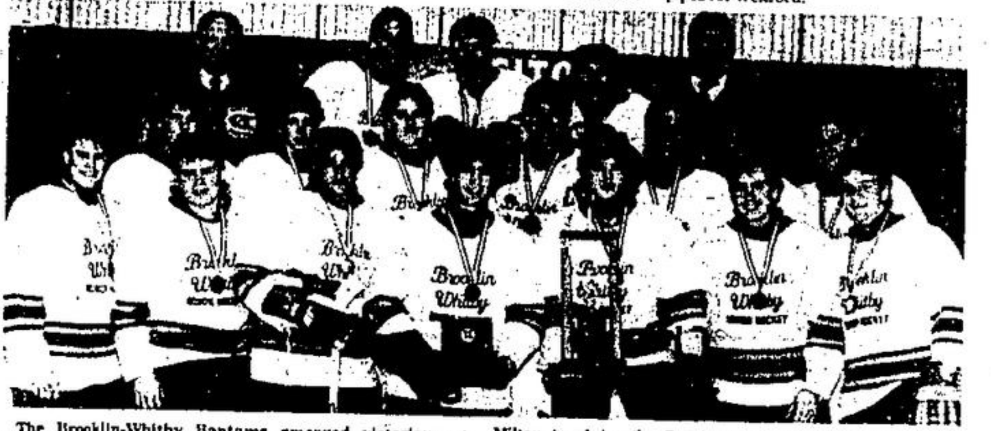
The Brooklin-Whitby Bantams emerged victorious at the 27th Annual Georgetown International Bantam Hockey Tournament on the weekend. The team defeated Milton to claim the B Division title at the tournament and then went on to down the Michigan Nationals in the grand championship Saturday night.