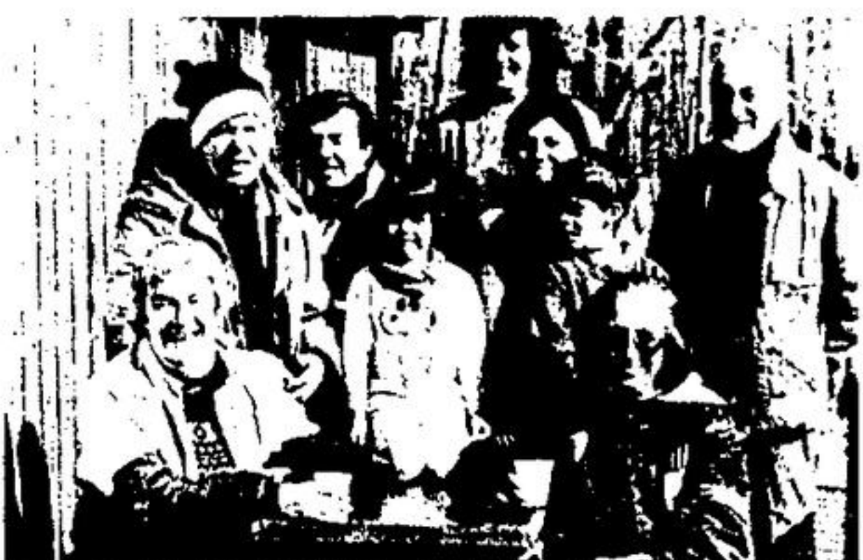
Despite a gloriously sunny and mild Saturday, turnout at the Georgetown District High School centennial reunion snow day at Terra Cotta wasn't as high as organizers had hoped. Among those