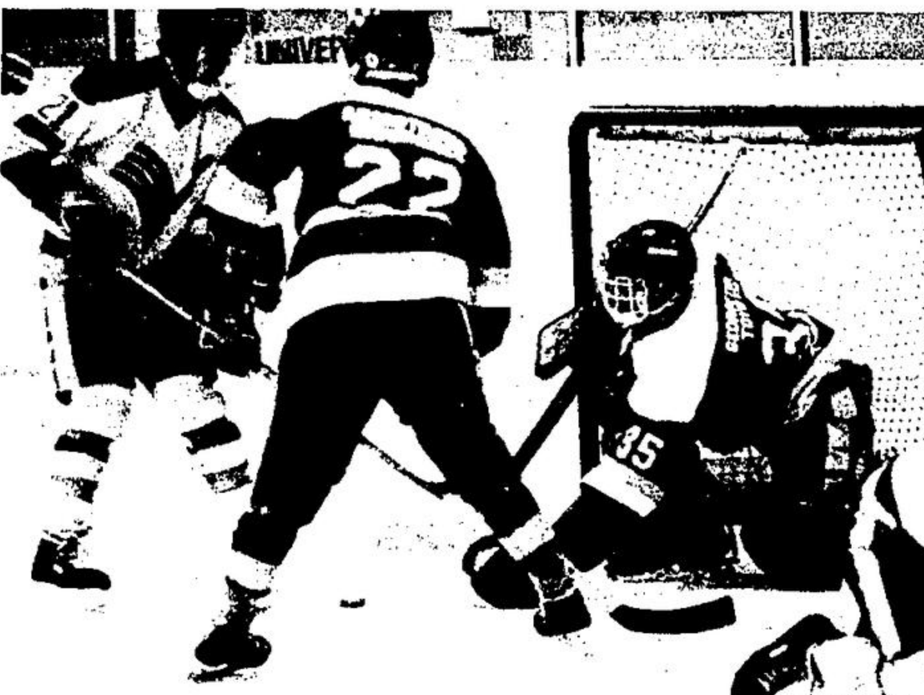
The Georgetown Gemini are no strangers to playoff hockey, having made it to post-season play seven times in their 11 seasons. But this year, despite a strong finish in regular season play, they are struggling against the Vaughan Raiders in a best-of-seven quarterfinal series.

In 1978-79, the same season the Streetsville Derbies went on to win the Sutherland Cup, the Gems finished a miserable 12th and missed the playoffs.