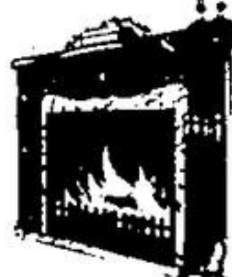
INTERIOR FINISHING TRIM, FLOORING, FIXTURES, ETC