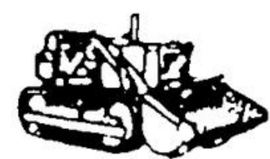
FINAL GRADING AND LANDSCAPING