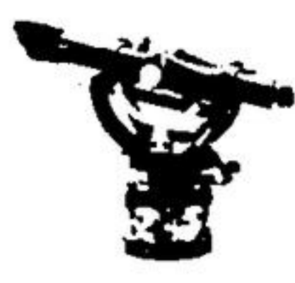
ENGINEERING SURVEYING LOT BUILDING PERMIT HEALTH PERMIT