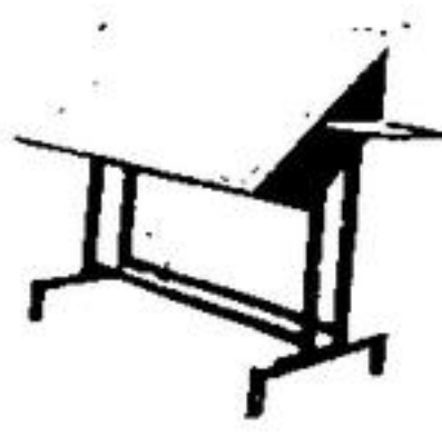
DRAFTING & DESIGN