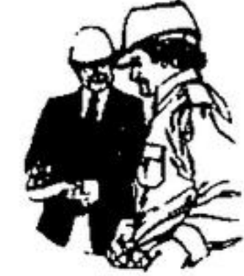
ON SITE SUPERVISION AND BUILDING INSPECTIONS