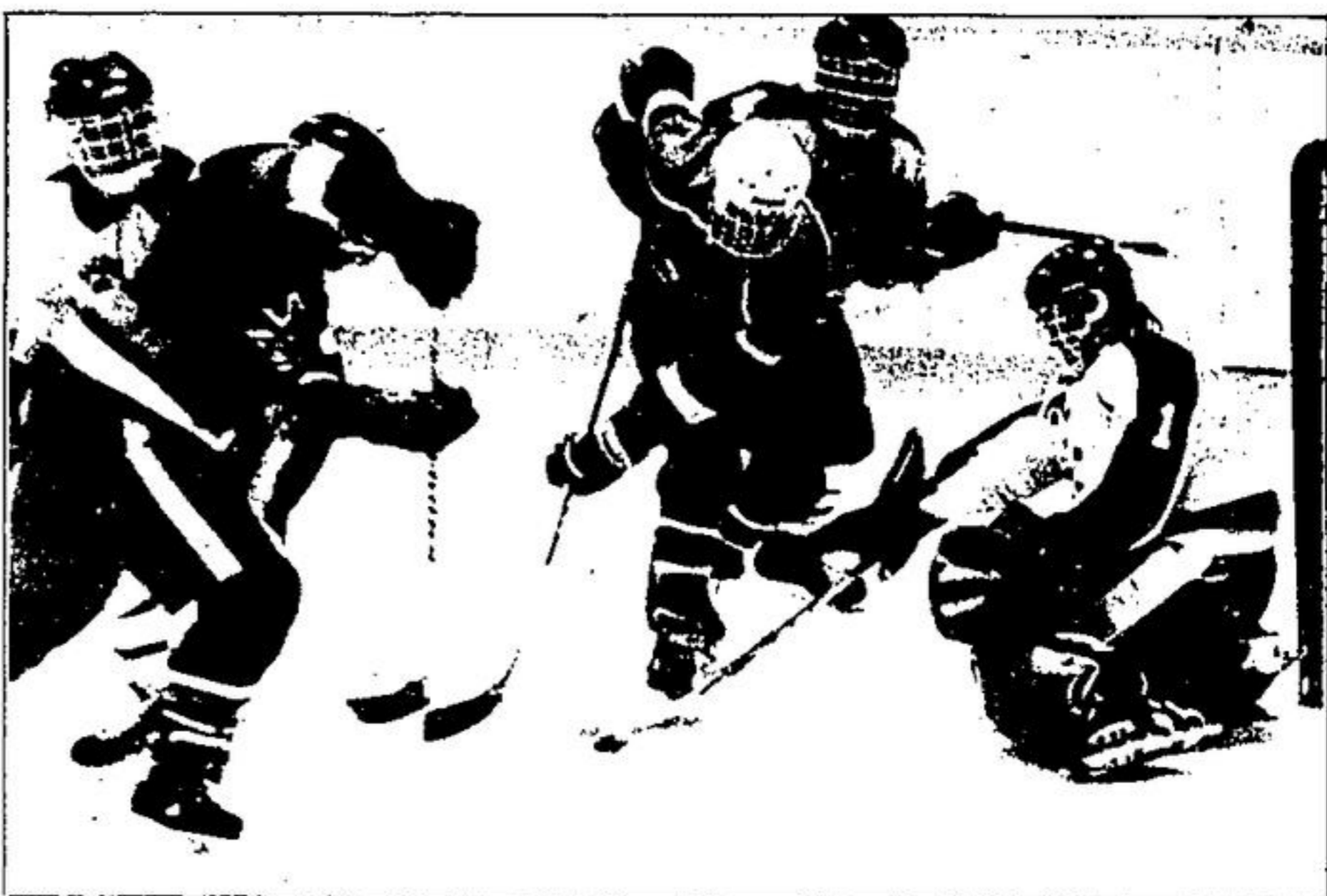
The Acton Sabres find themselves trailing the Orangeville Crushers two games to none in a best-of-seven divisional semi-final playoff, after they lost a pair of games on the weekend. Here, two Sabre players attempt to get a shot on the Orangeville goaltender as he tries to gather in the puck during action Friday night in Orangeville.

Further games, if necessary, have been slated for Monday in Orangeville, Tuesday in Acton, and Wednesday in Orangeville.