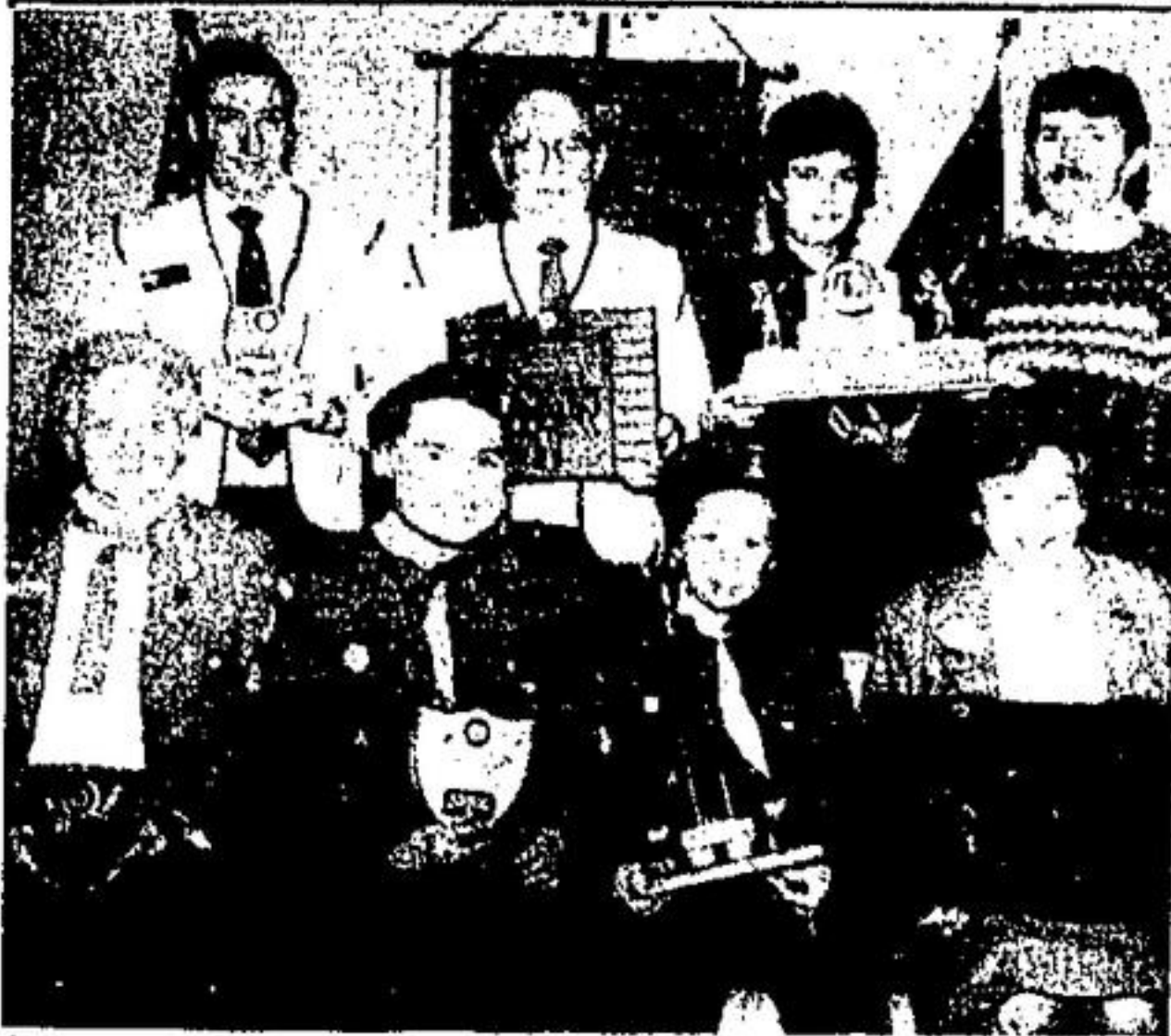
Everyone had fun at the Georgetown Santa Claus parade, but some lucky entrants also won prizes for their floats. Seen here are the winners in a variety of categories