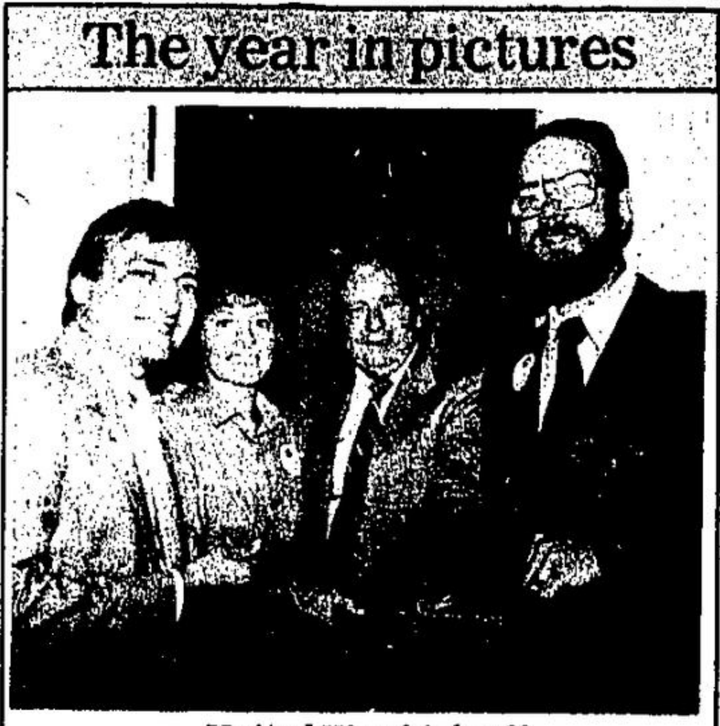
United Way kick-off