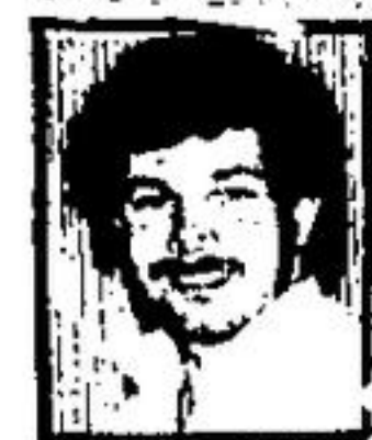
Playing the field