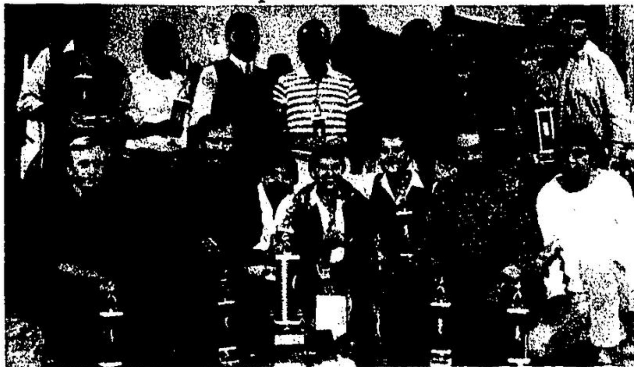
Park-Lincoln Mercury captured double honors in the Halton Hills Service Club Slo-pitch League this year. The team won the league playoff series and were also the "B" champs. The team was formally honored Saturday at a league banquet held at the Elk's Lodge in Norval.