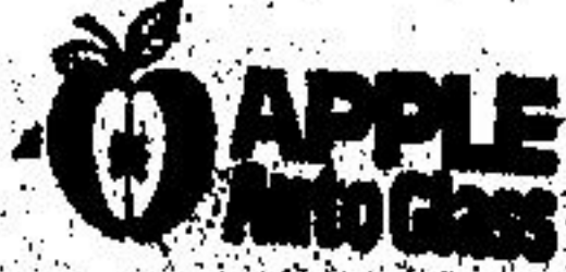
a Canadian owned chain of 60 stores across Canada.