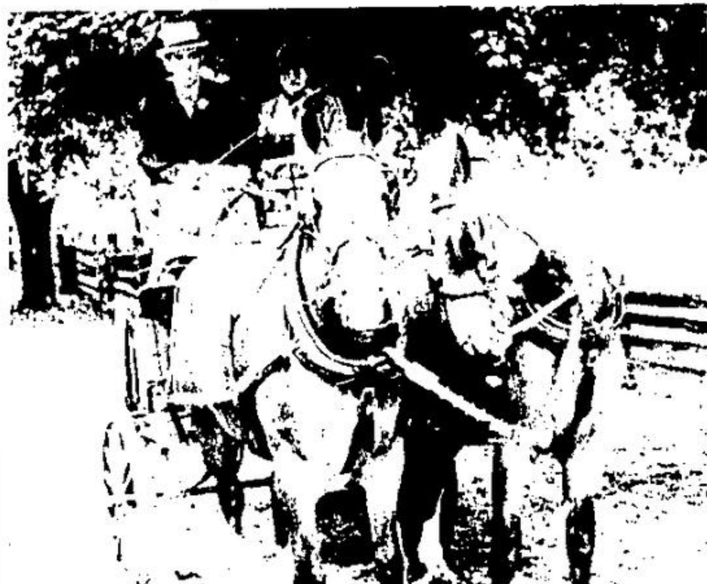
Finely groomed horses, beautiful carriages and well dressed riders were part of the show at Heritage Horse Park Sunday. Ken and Maxine Ribbey are seen here waiting to enter the performing arena.