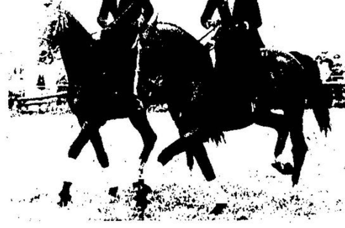
The art of riding side saddle was one of the many demonstrations of horsemanship at Heritage Horse Park Sunday. More than side saddle, these ladies performed tricks with their horses.