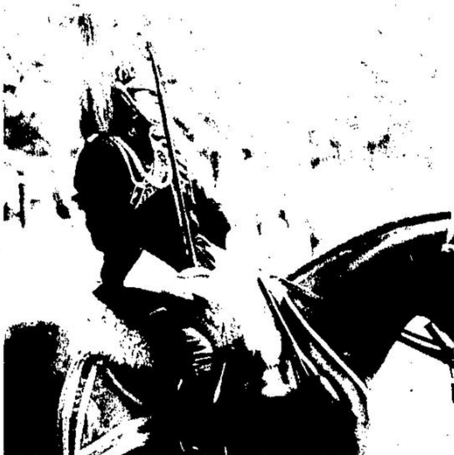
The Governor General's Horse Guards performed a number of tasks at Heritage Horse Park Sunday, including escorting the guest of honor, the honorable Vincent Kerrio, Ontario minister of Energy and Natural Resources. They also performed a musical ride and gave a demonstration in tent pegging.