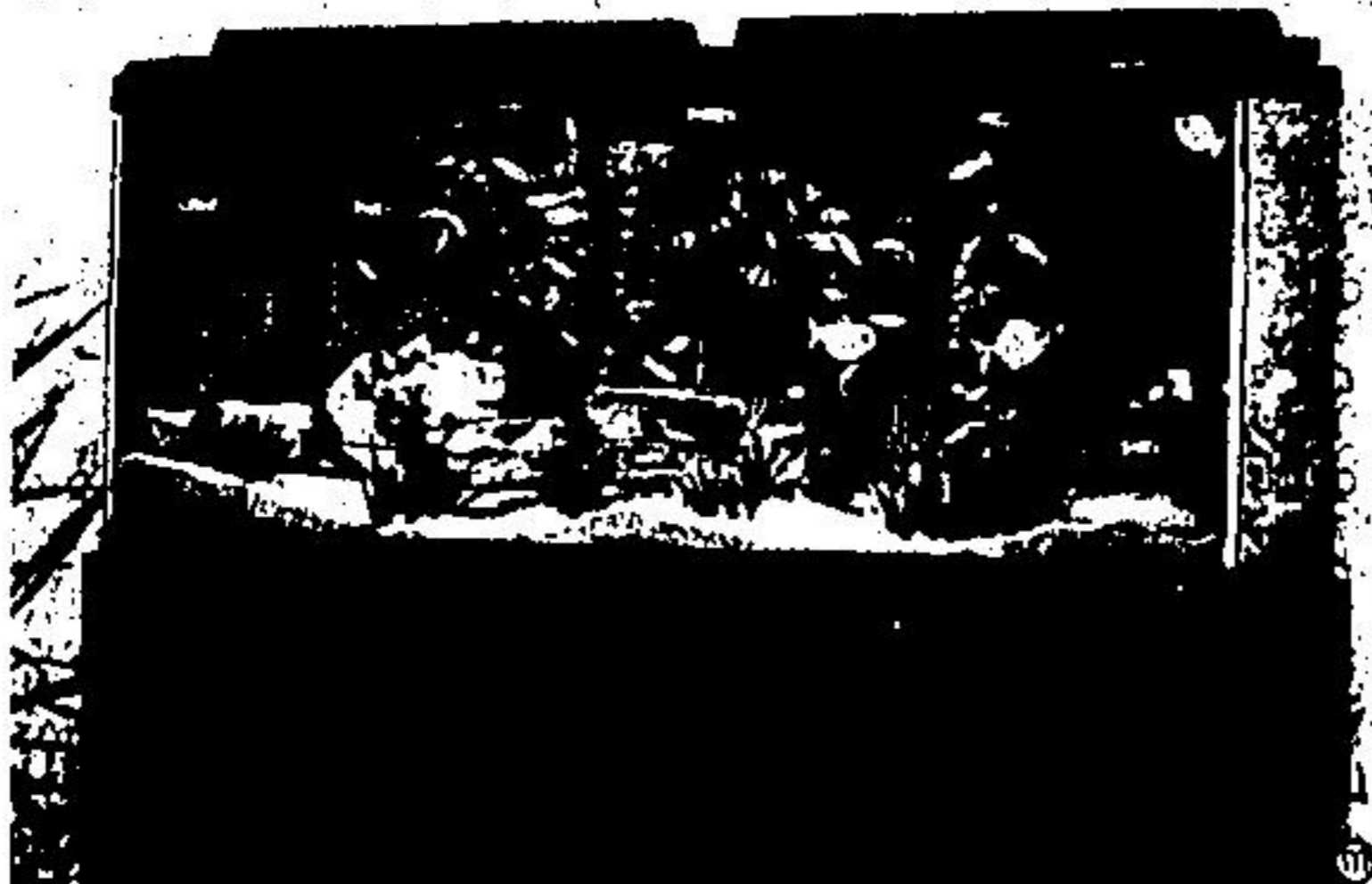
BRIGHTEN YOUR HOME with a colorful, lively aquarium that will provide hours of enjoyment for the entire family.

ter temperature, tropical fish require an environment maintained at around 75°F (25°C). You will therefore need a good heater and an aquarium thermometer.