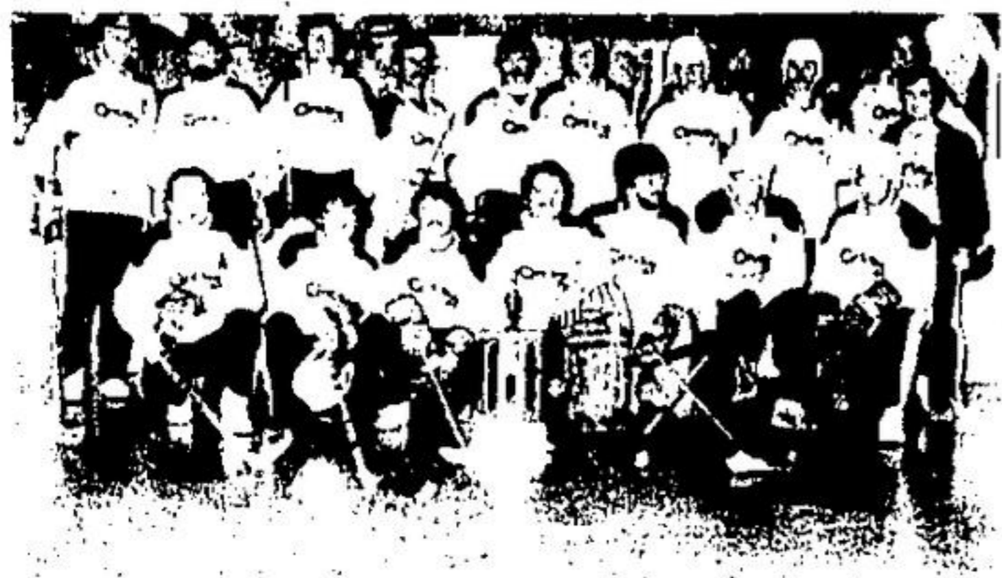
Century 21 finished in first place overall in the Over-30 Ball Hockey League. As a result of this, the team was given the trophy for being the top team in the regular season.