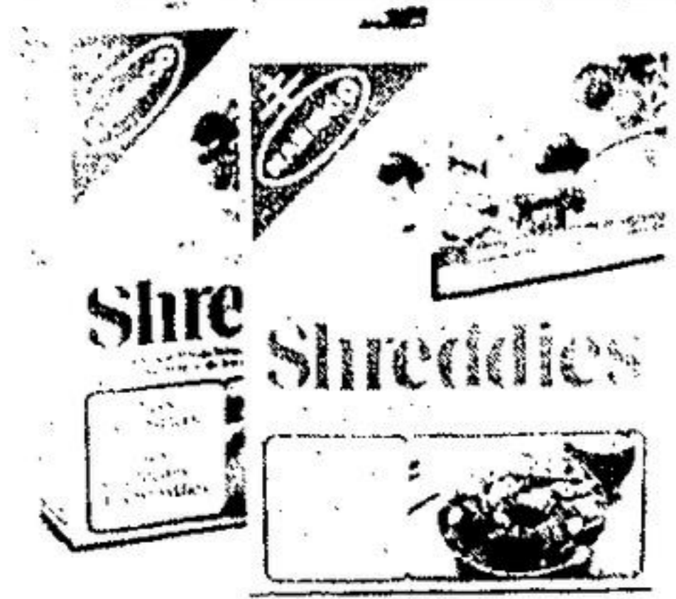
CEREAL Shreddies 675 g BOX SAVE 1.20