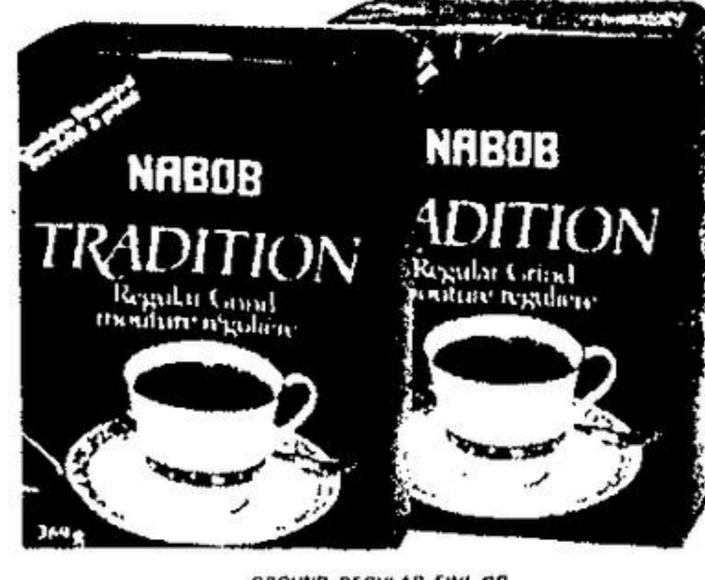
Nabob Tradition 369 g VAC PAC SAVE 1.50