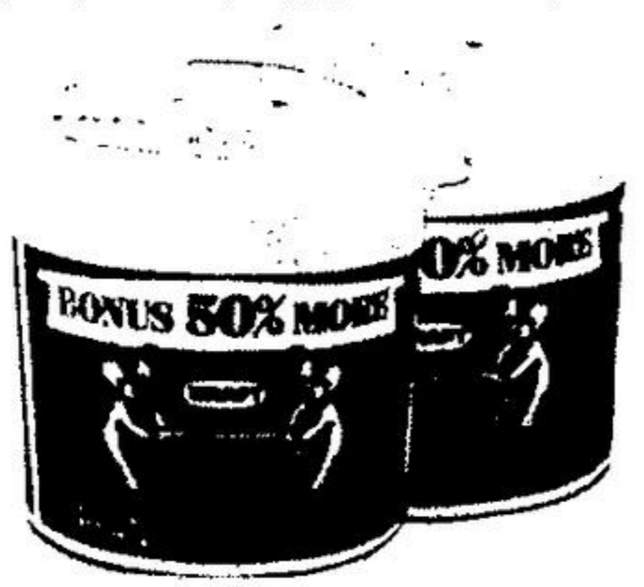
SMOOTH, BONUS PACK Kraft Peanut Butter 1.5 kg PAIL