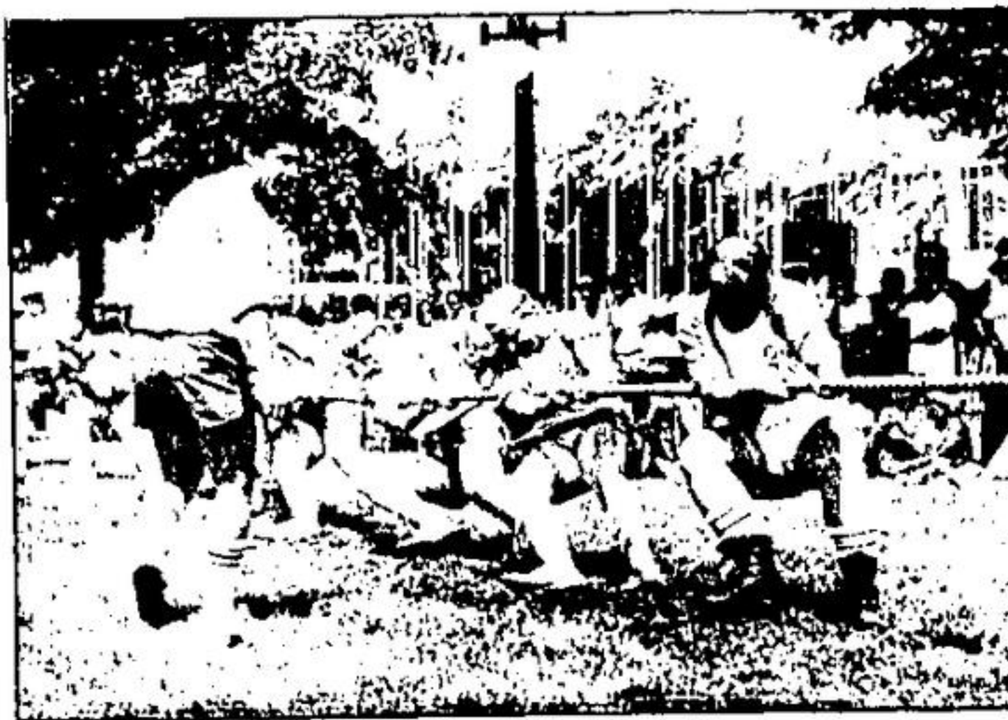
The tough, strong contingent representing Halton Region Police weren't good enough to be the top tug-of-war team at the 'EX'. However, they did put on a good showing for spectators.