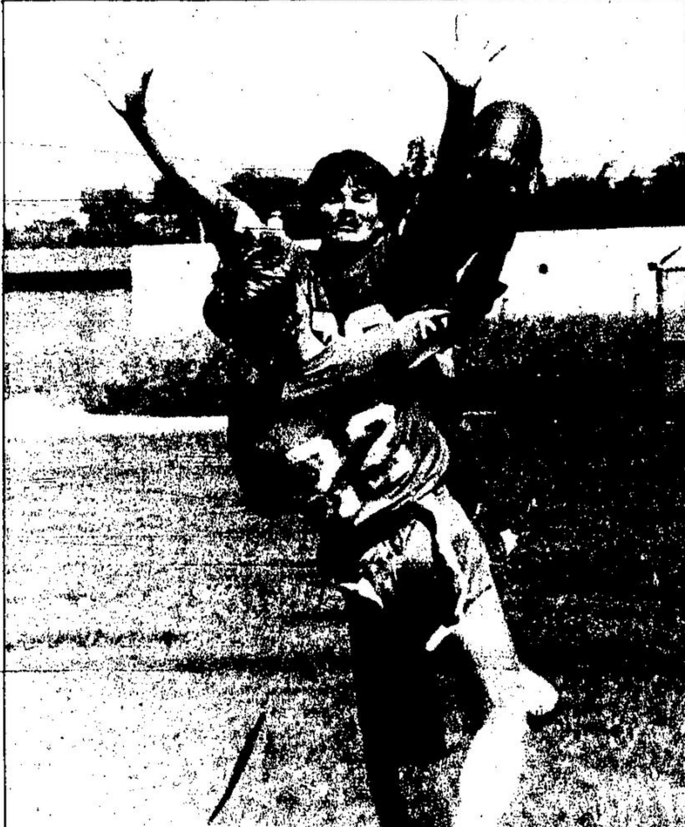
BLOCK THAT PASS-A Corrigan Instruments player here tries desperately to block this "Greeks" pass attempt. While the Corrigan player didn't stop this pass, his teammates managed to stop the O'Tooles (formerly "Greeks") squad handily in Georgetown men's Flag Football League play Sunday. Corrigan won 58-11.