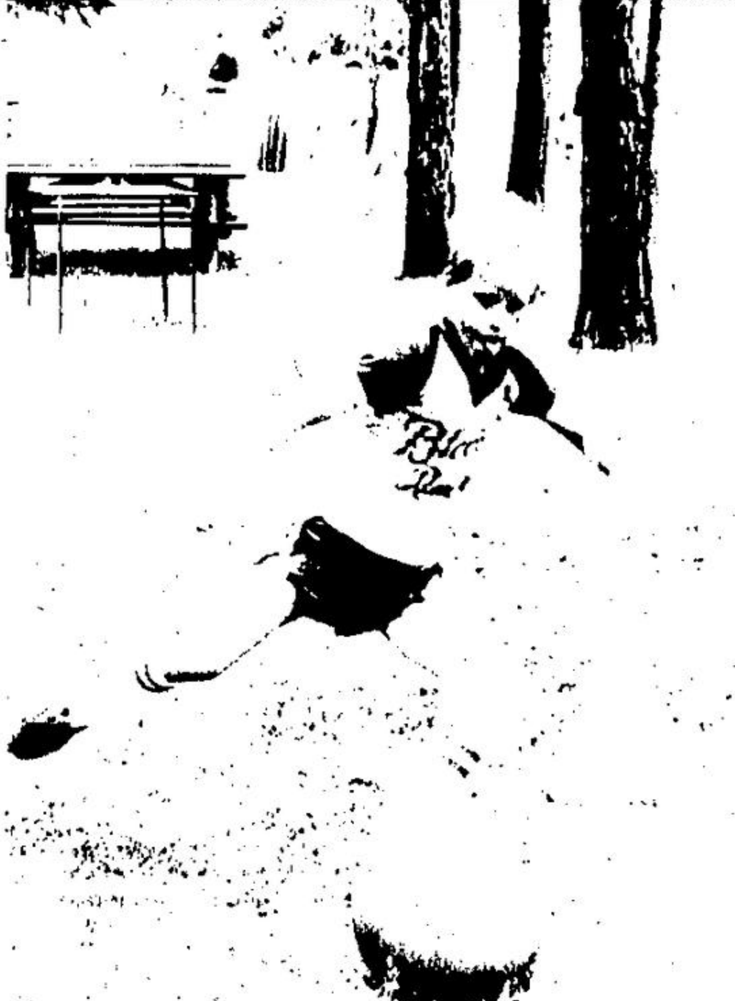
Giving it his all