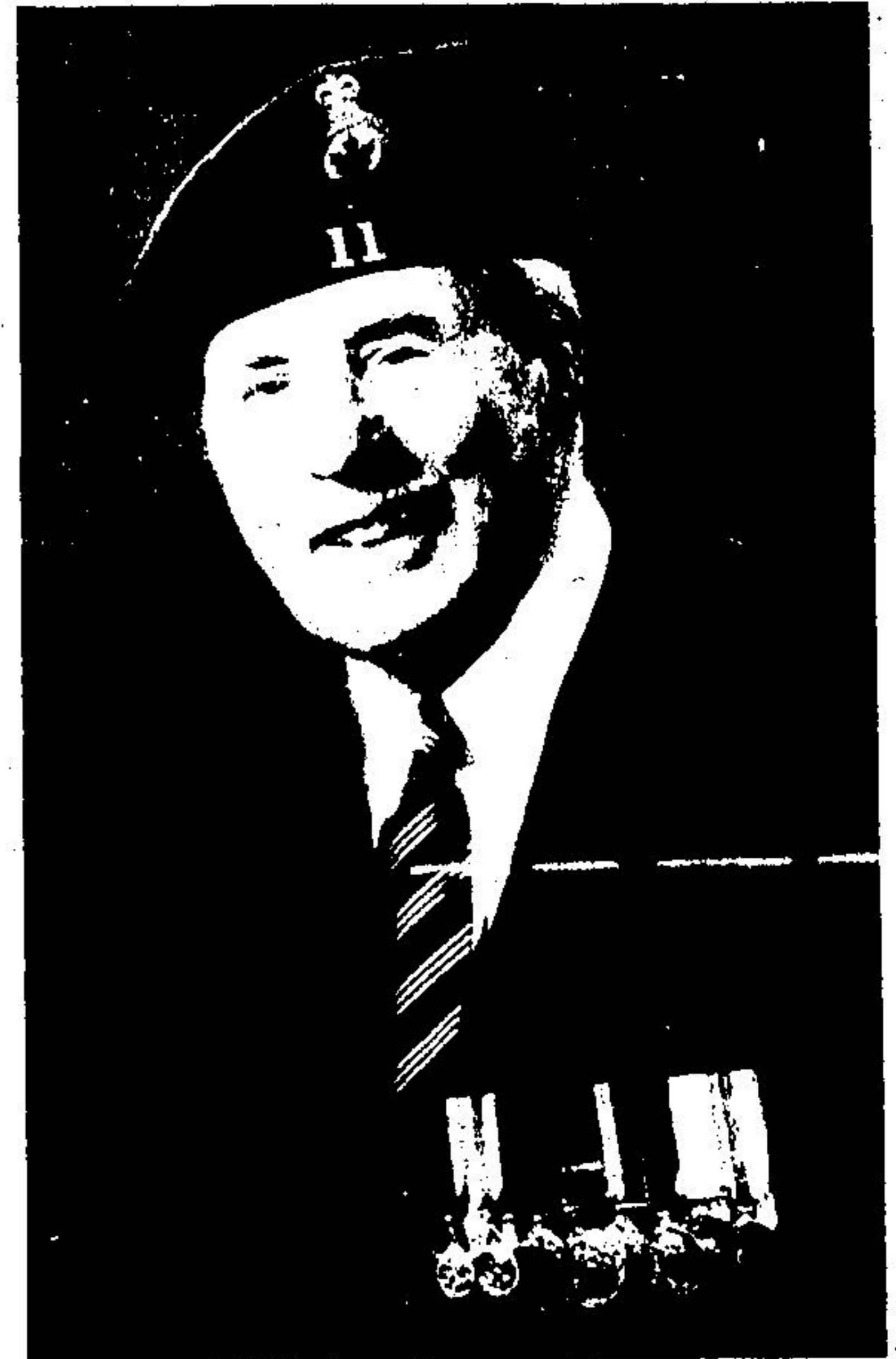
George Hees Minister of Veterans Affairs