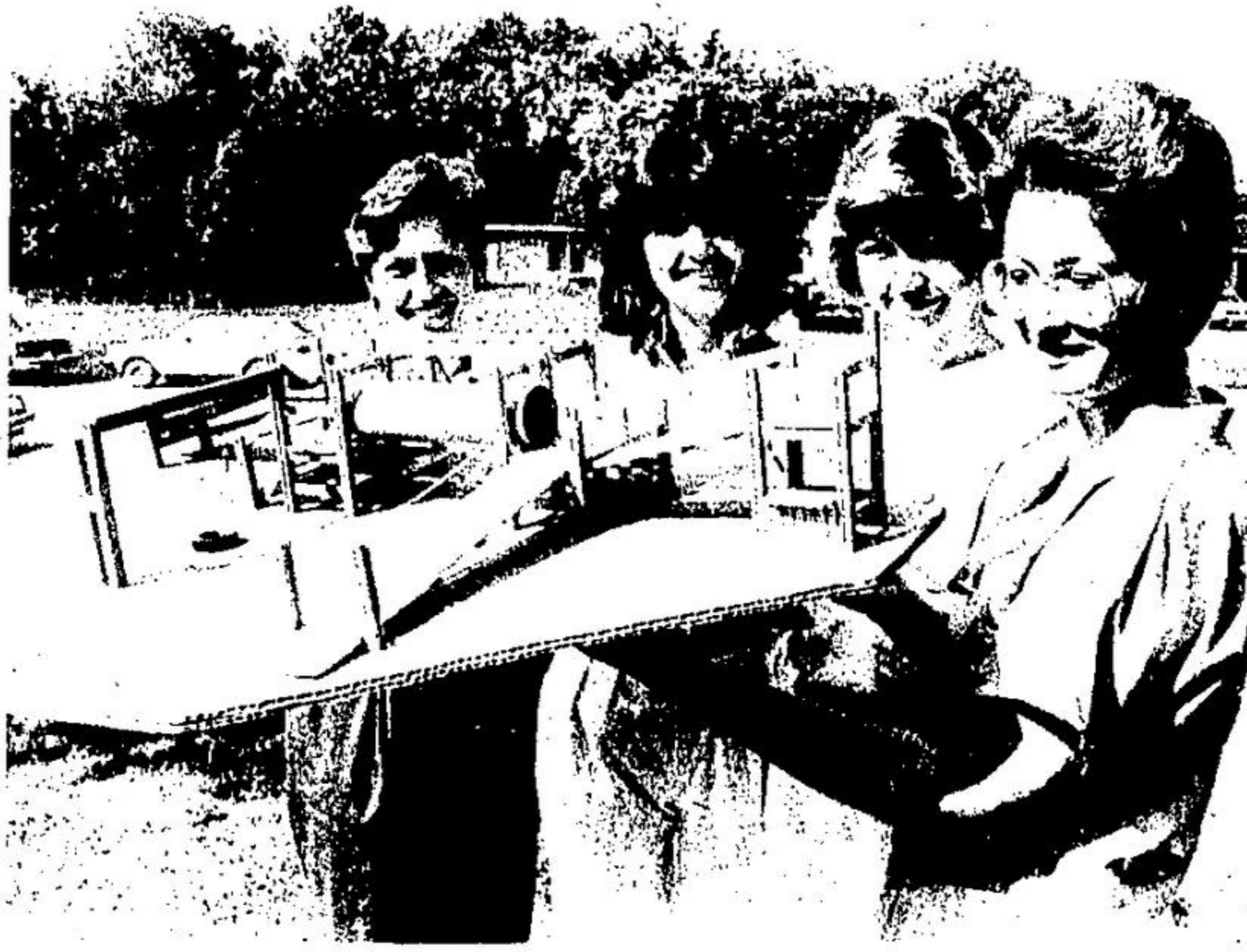
To be young again!

Sat. & Evening Appointments Available - Free Consultation -