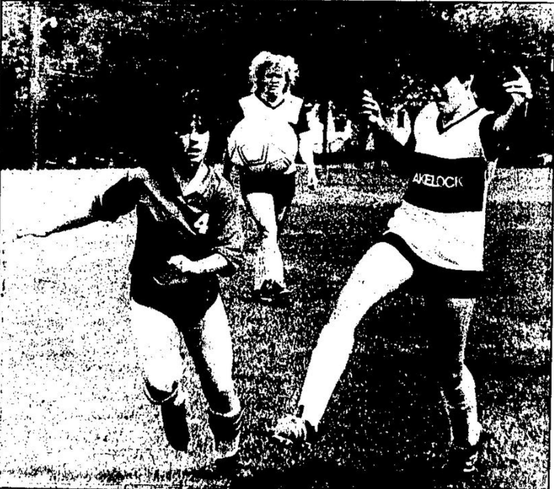
AIR BALL-A Georgetown District High School junior girls' soccer team player and a T.A. Blakelock competitor try to gain possession of the ball on this play. The two teams met last week at the Georgetown field, with the visitors coming out on top 1-0. However, the junior Rebels bounced back with a win in their other game of the week to gain a split.

A win by the juniors would result in the local team hosting their first round playoff game tomorrow. Even with a loss, it's likely the Rebels will still host their first round game anyway. Should the senior squad triumph then it will be on the road for its first playoff match. The senior playoff contest too would be played Thursday.