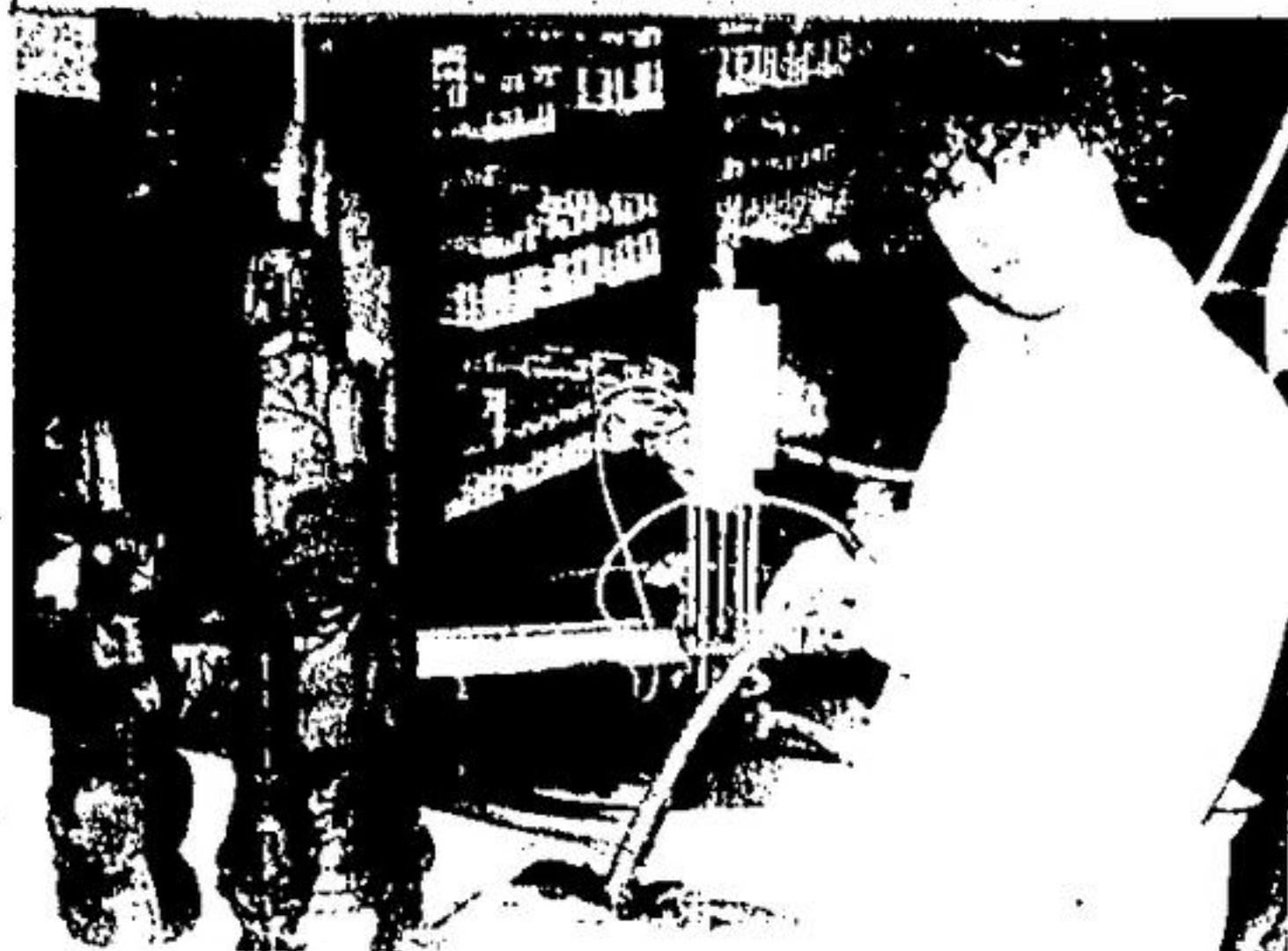
Schneider's Reliable Sweets is making a production out of chocolate Easter sweets. Roz Gareh, the president, is pouring chocolate into a mold which in a few minutes will be a bunny. Schneider's is at 197 Main St. South in Ruckwood.