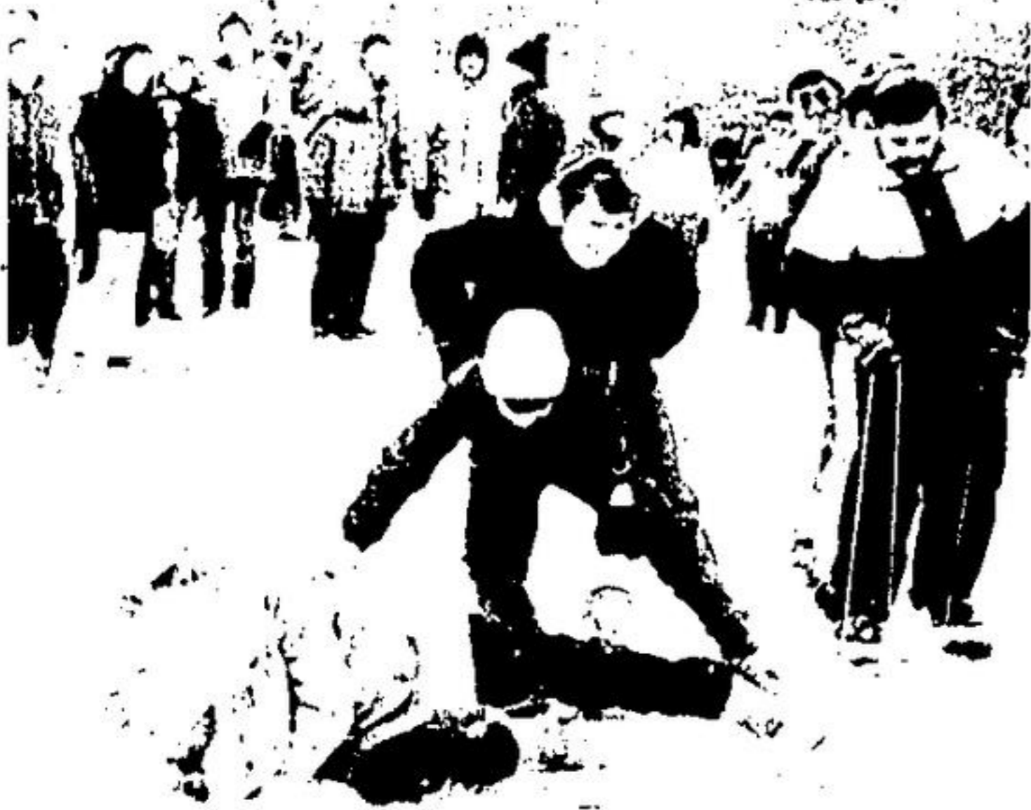
Getting your act together becomes a little tricky when you've got four pairs of legs to co-ordinate. The tandem ski races at the Terra Cotta Conservation Area proved to be a lot of