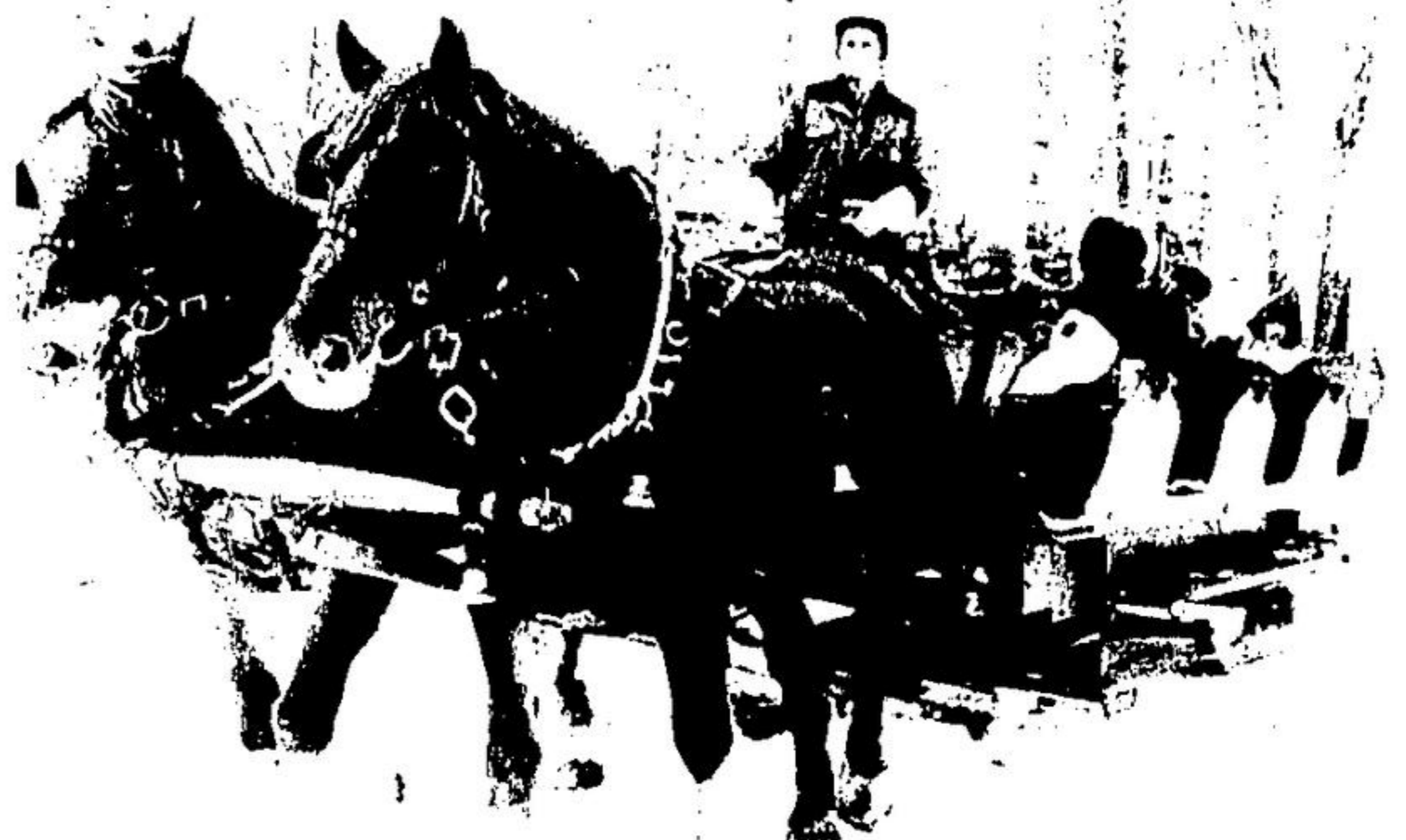
Clomp clomp clomp. Nothing like a horse drawn sleigh ride on a wintery