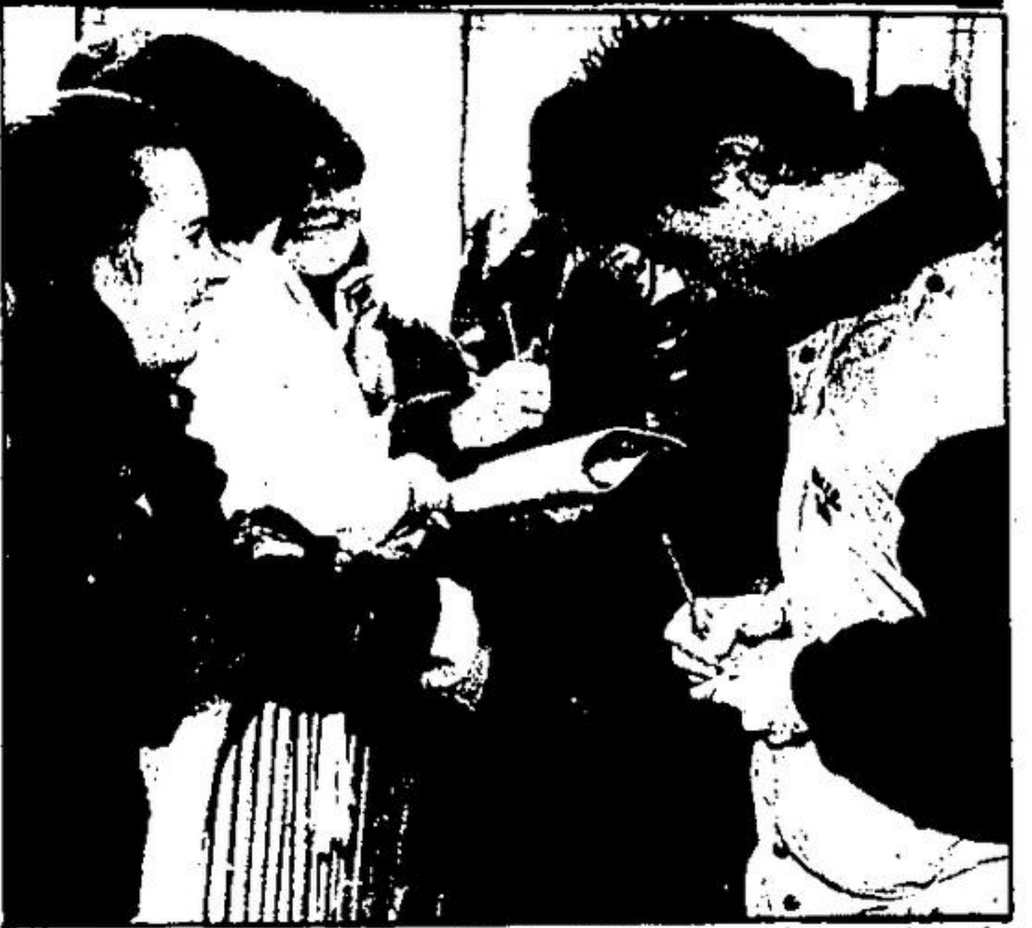
ADMIRING FAN-A member of the Swedish Junior team signs an autograph for a fan after his club's game with West Germany Thursday. There were many autograph seekers waiting for the Swedes after their 10-0 win at the Alcott Arena.