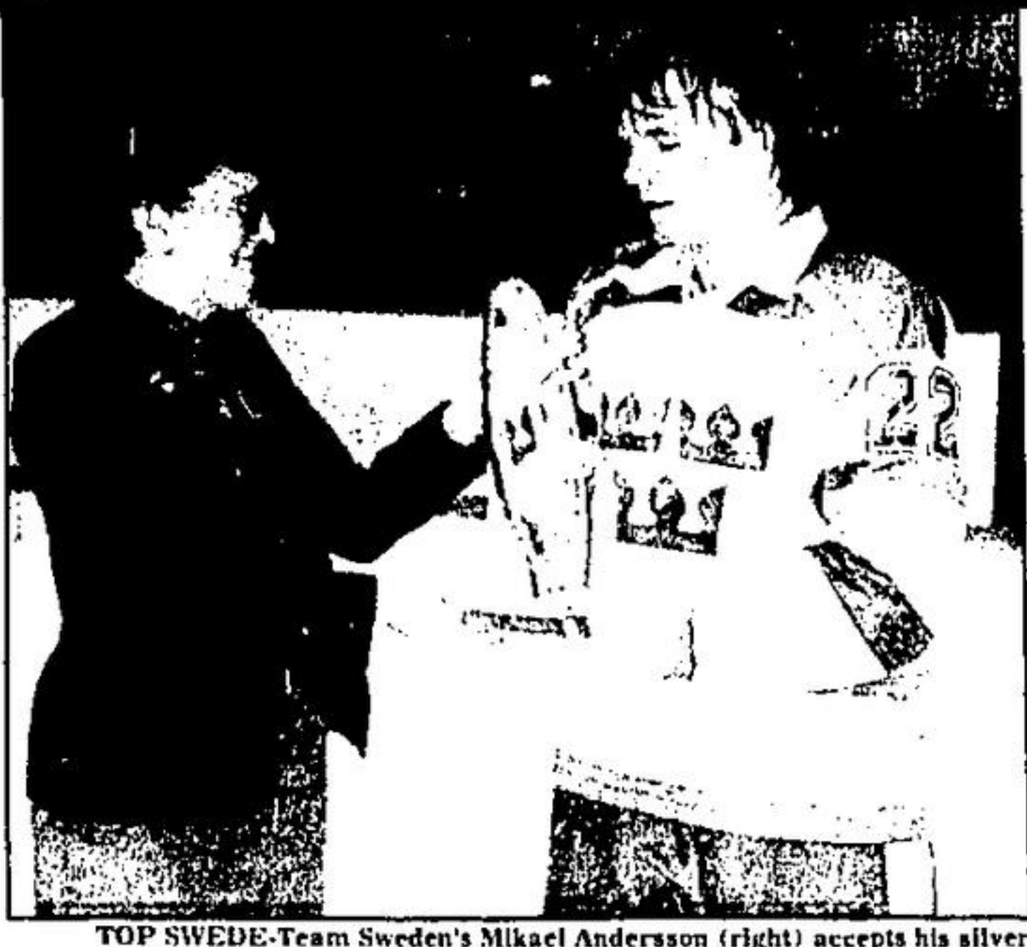
TOP SWEDE-Team Sweden's Mikael Andersson (right) accepts his silver tray after being named the Sweden Most Valuable Player in Thursday's game. Andersson had three goals and an assist in the 10-0 win. Andersson went to the Sweden team on loan from the National Hockey League's Buffalo Sabres.