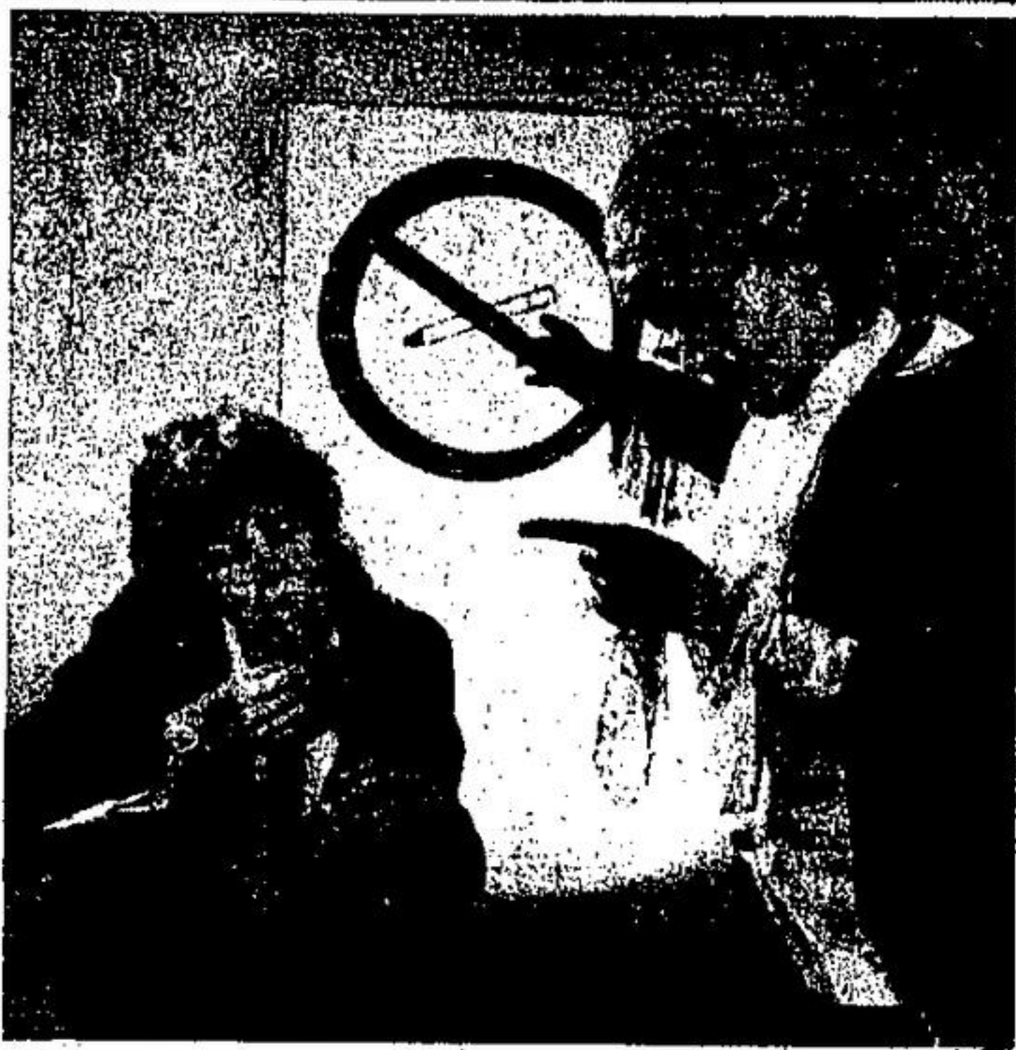
Those talented members from the Toy Town Troupers will be at the John Elliott Theatre Oct. 19 for their production of Breaking Away . The play for children is a fun filled show about

smoking that has a message that will last a lifetime. The show begins at 1:30 p.m. and tickets are $2. For more information call 877-5185 ext. 219, 260 or 267.