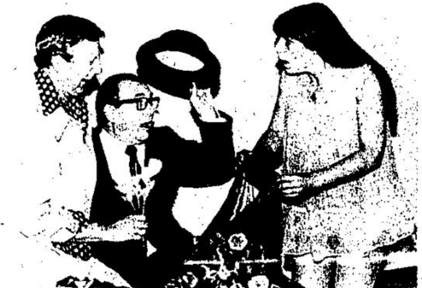
Laugh after laugh is in store for those attending Georgetown Little Theatre's Move Over Mrs. Markham . The play will be at the theatre

Oct. 25, 30, 31, Nov. 1 and 2. For ticket information call the box office at 877-3700.