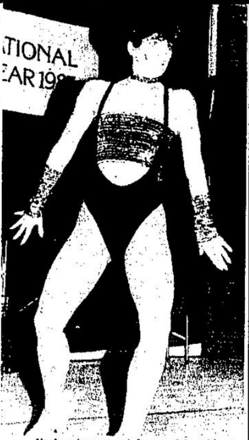
No beauty pageant is complete without dancing girls. A professional troupe from Toronto called Dream Girls danced Friday night.