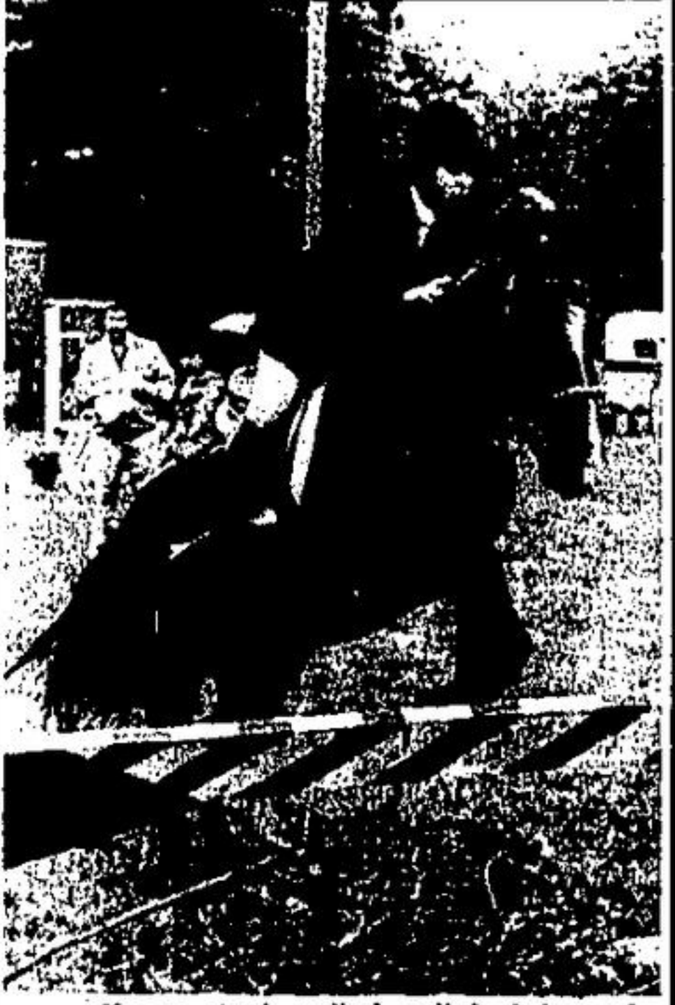
Horses stood, walked, pulled sleds, and jumped for prizes at the Fair. The equestrian event featured many fine horses and riders who rarely missed a jump.