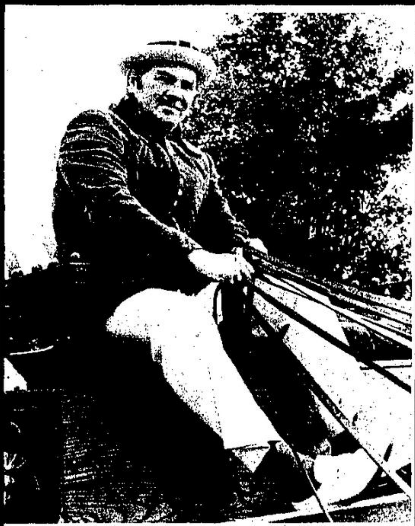
The quality of an Ontario Fair can be judged on whether or not the Carlsberg wagon pulled by champion horses shows up. The wagon was in Saturday's parade.