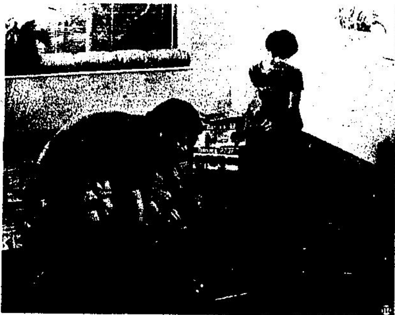
NOW YOU CAN INSTALL an elegant wood parquet floor over almost any subfloor — concrete, vinyl or wood. It's quick and easy with the new self-stik wood floor tiles, available in 12" x 12" tiles in a variety of colors.