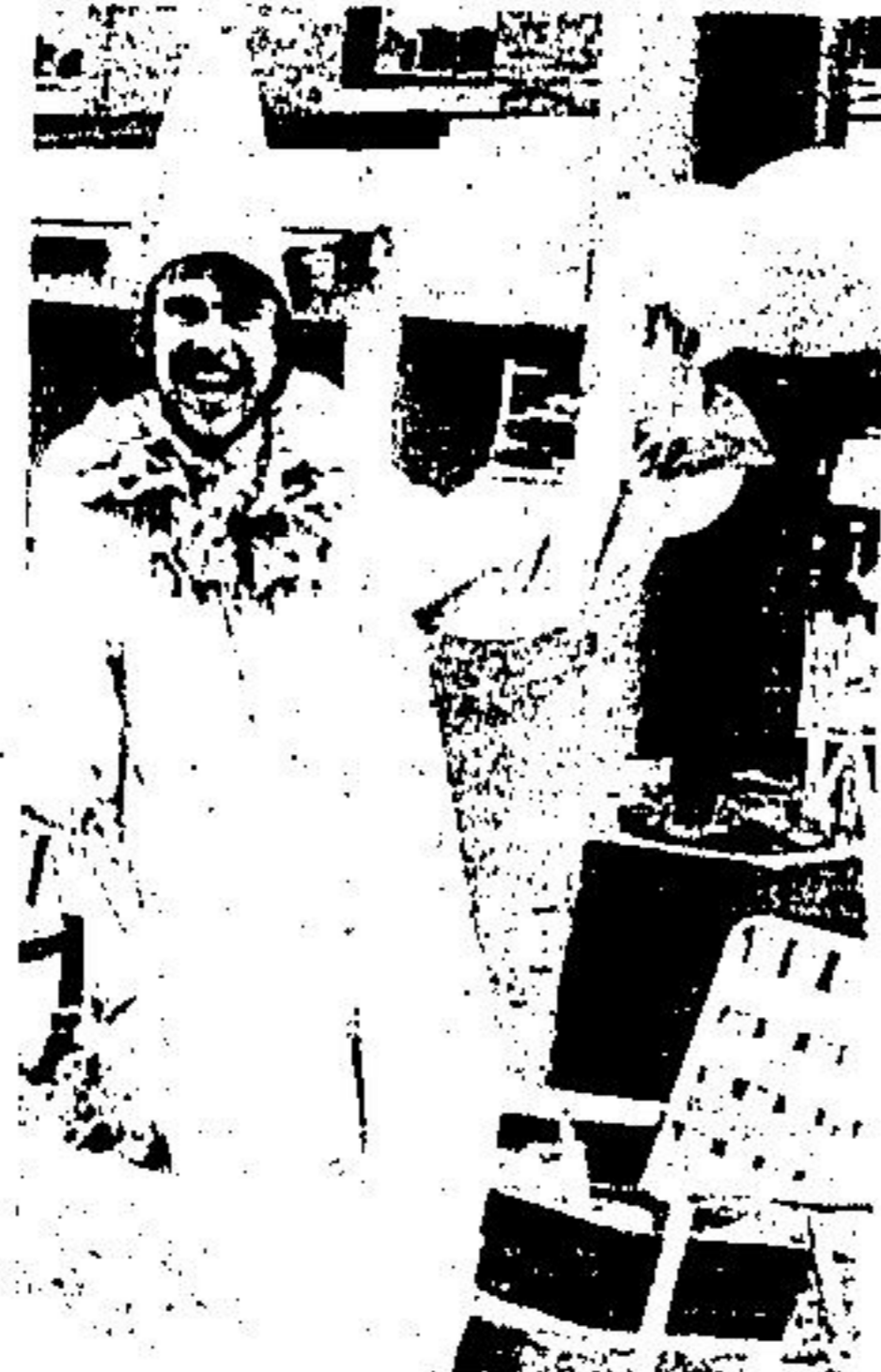
FREE BALLOONS ARE A FAVORITE WITH CHILDREN AT PIONEER DAYS

A community health nurse will be available to answer questions and provide printed materials related to the lifestyle areas assessed.