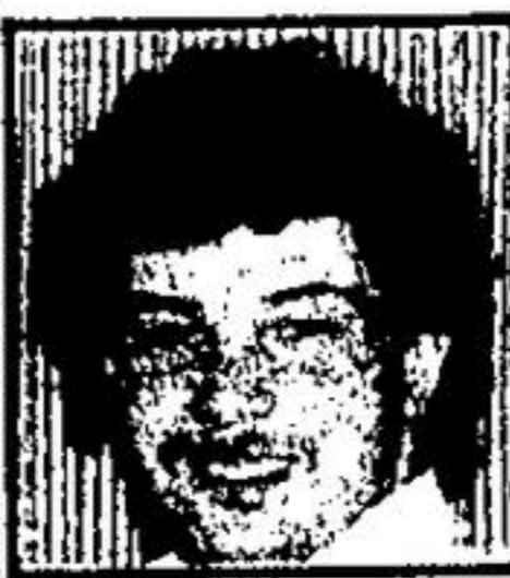
PLAYING THE FIELD