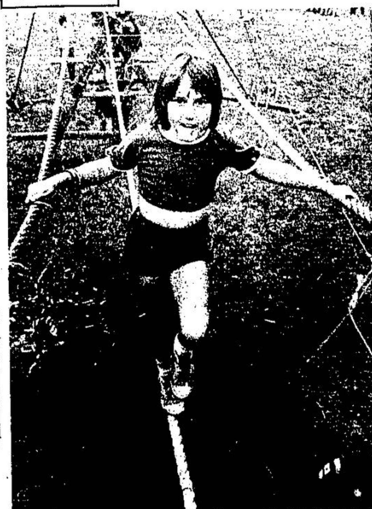
Everyone got a chance to climb the home-made Scout ladders and equipment. Best of all, it was free and the kids got lots of exercise. Here, one of the children scrambles up to the top.