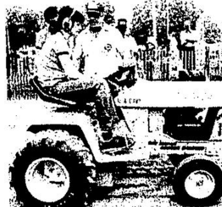
Crowds watched with awe as these mini-monster tractors pulled weights across the Fairgrounds Park field at the Bang-O-Rama celebration on Victoria Day. The rain later in the day didn't allow for the pull to be completed.