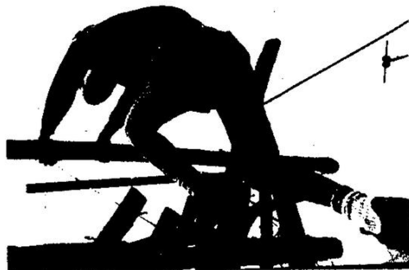
The Scout rope bridge proved to be a favorite with the children at Bang-O-Rama. It was carefully supervised by Scout leaders.