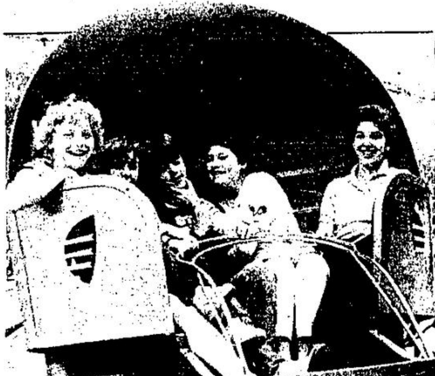
If you're a teenager, then the midway at Bang-O-Rama is the place to be for chills and thrills. These five young people are getting bumped around on a whirl 'n' whirl.