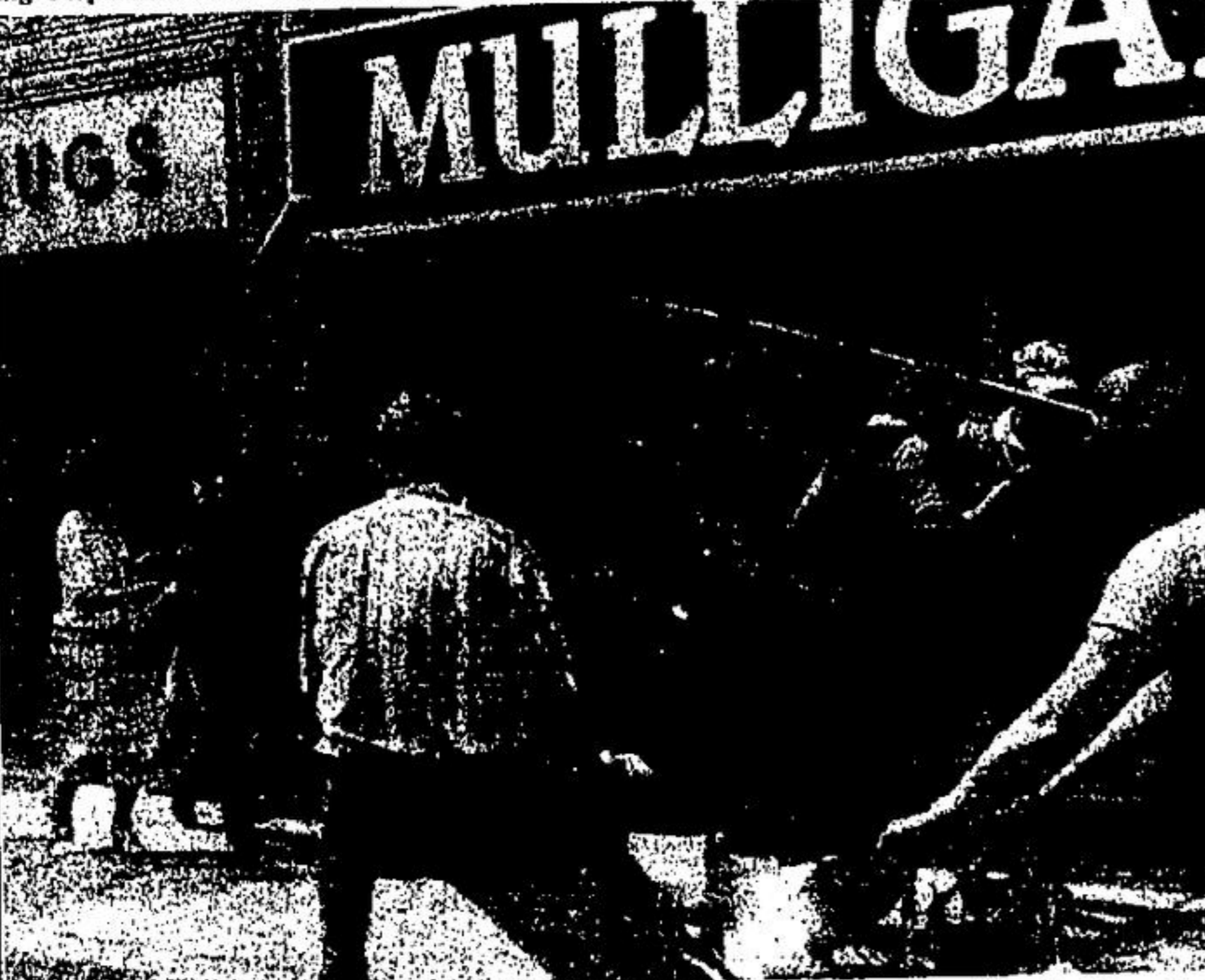
A long mike is seen above to catch the dialogue going on between these two actors. The scene here was a rehearsal for a scene that was eventually shot downtown for the Canadian Broad-