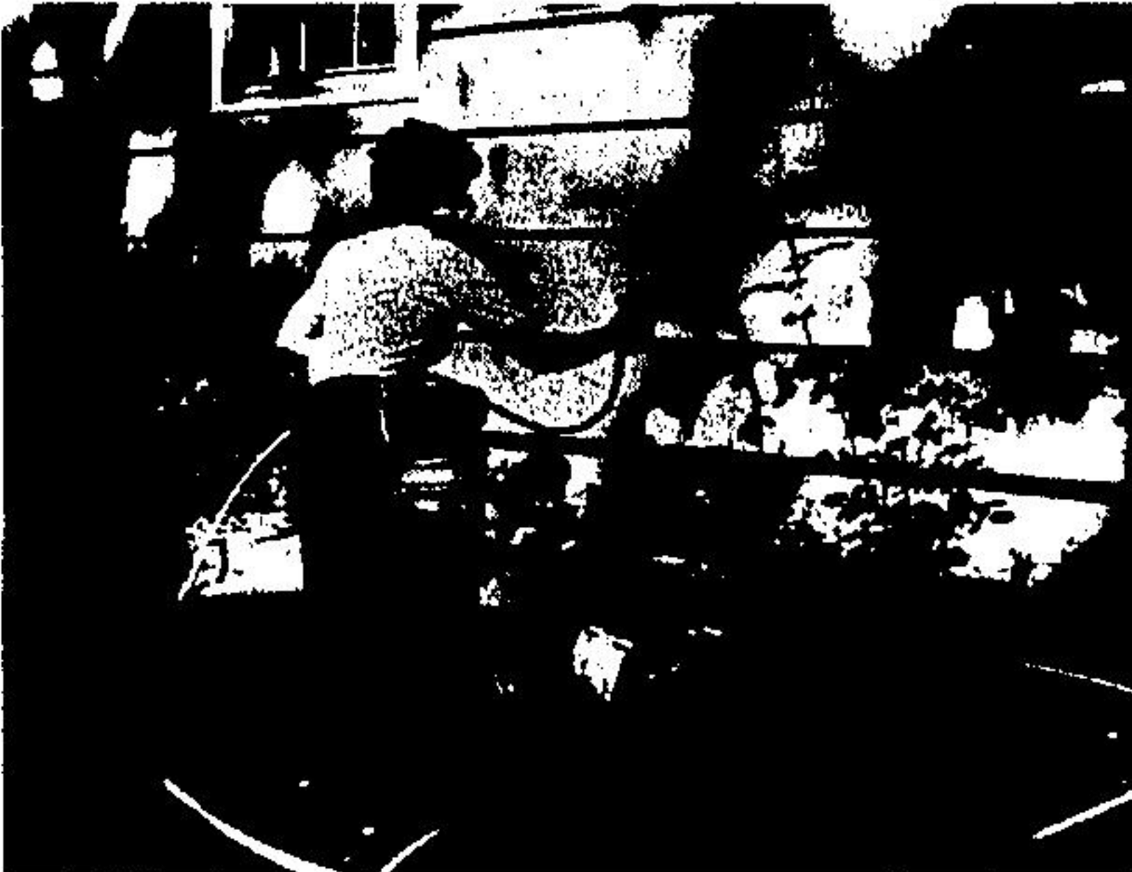
A PAINTING JOB that would require four hours with a hand brush can be done in as little as an hour with a power sprayer.