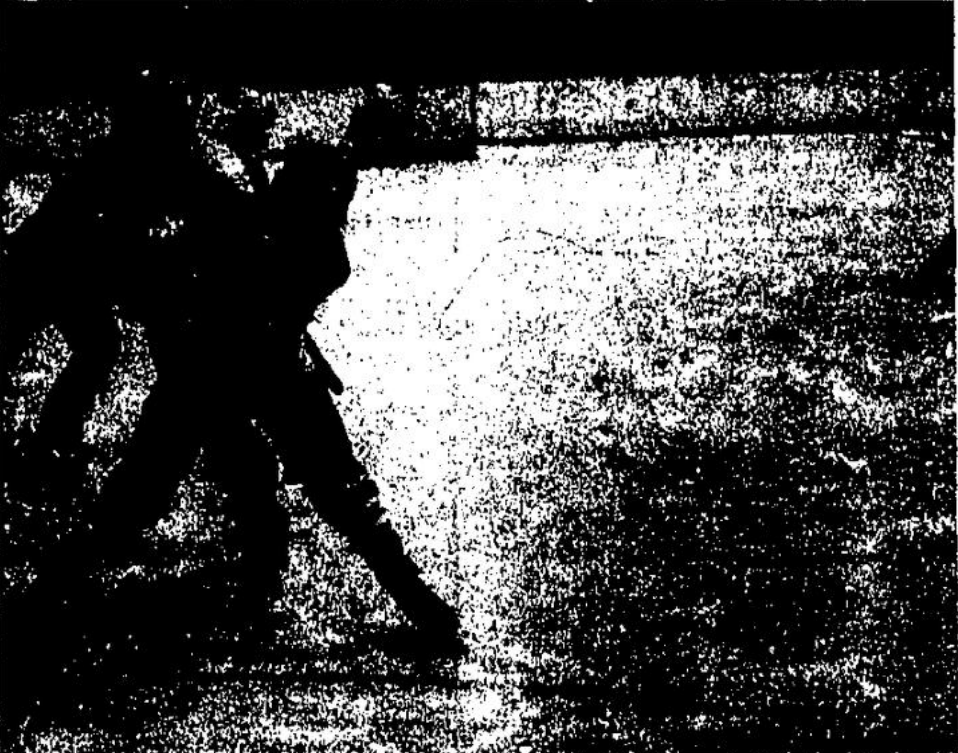
A Brooklin-Whitby player is about to get knocked off the puck by a member of the Georgetown M and M Pro Sports bantam team. Georgetown and Brooklin-Whitby met in the "B" division semi final, with the locals dropping a 5-0 decision that eliminated them from the tournament. Brooklin lost in the final to Richmond Hill.

Acton goal scorers weren't available for the three wins.