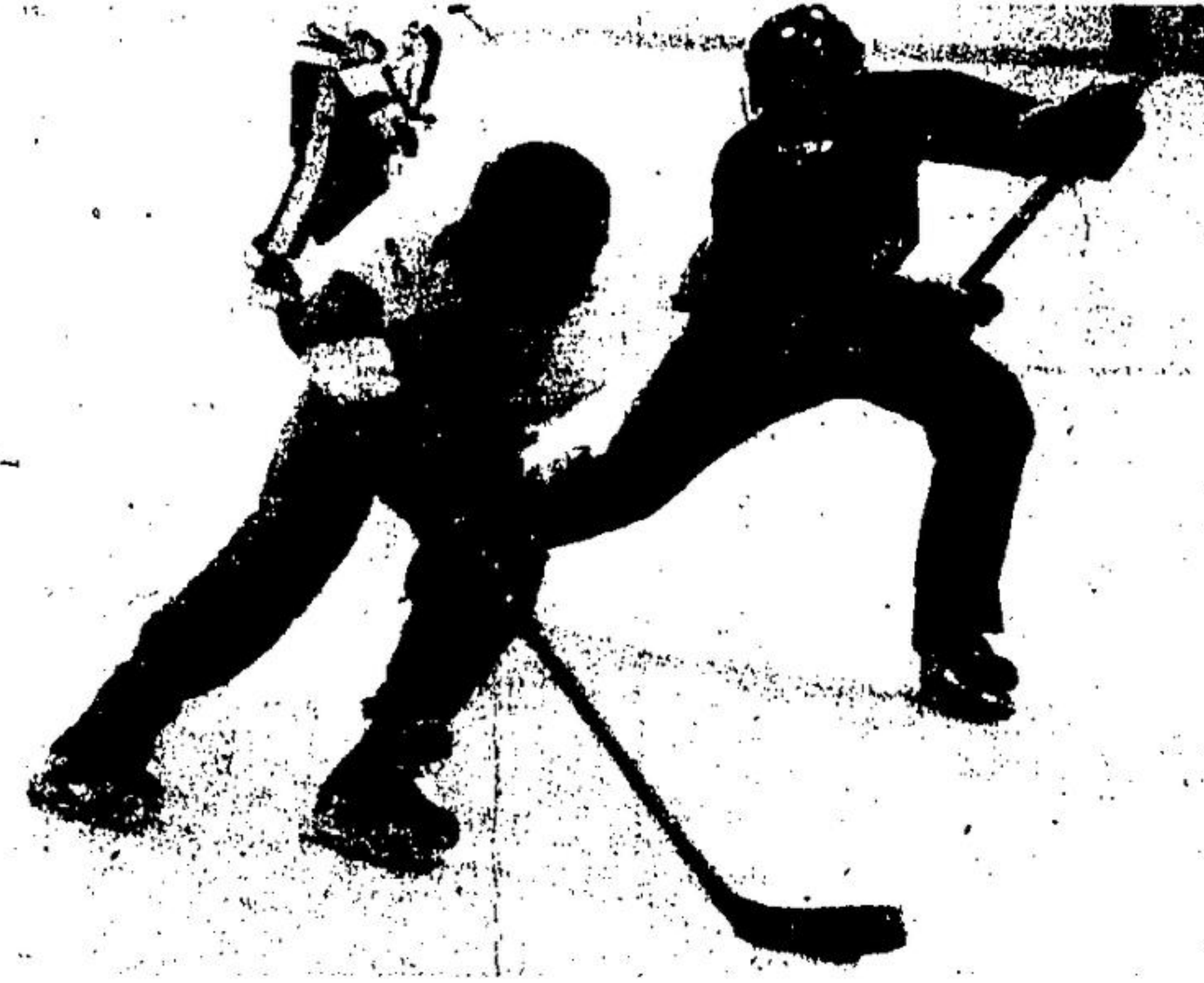
A Georgetown M and M bantam player and a member of the Brooklin-Whitby team fight for position while going for the puck. The Georgetown and Whitby teams were playing in the "B" division semi final, won 5-0 by the Brooklin-Whitby squad.