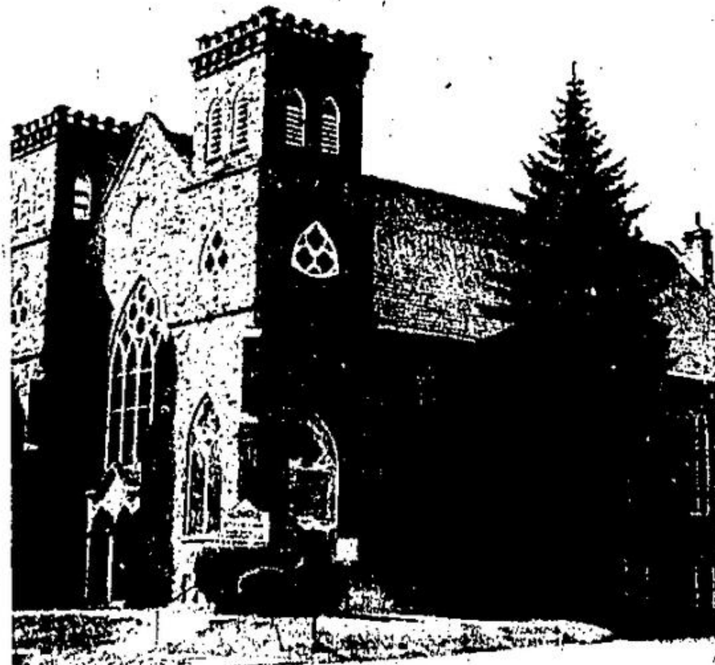
Knox Presbyterian Church has a long and entertaining history. The congregation plan to celebrate their church's 125th anniversary with a variety of events.

Details of the anniversary celebrations are being worked out by the parishioners now.