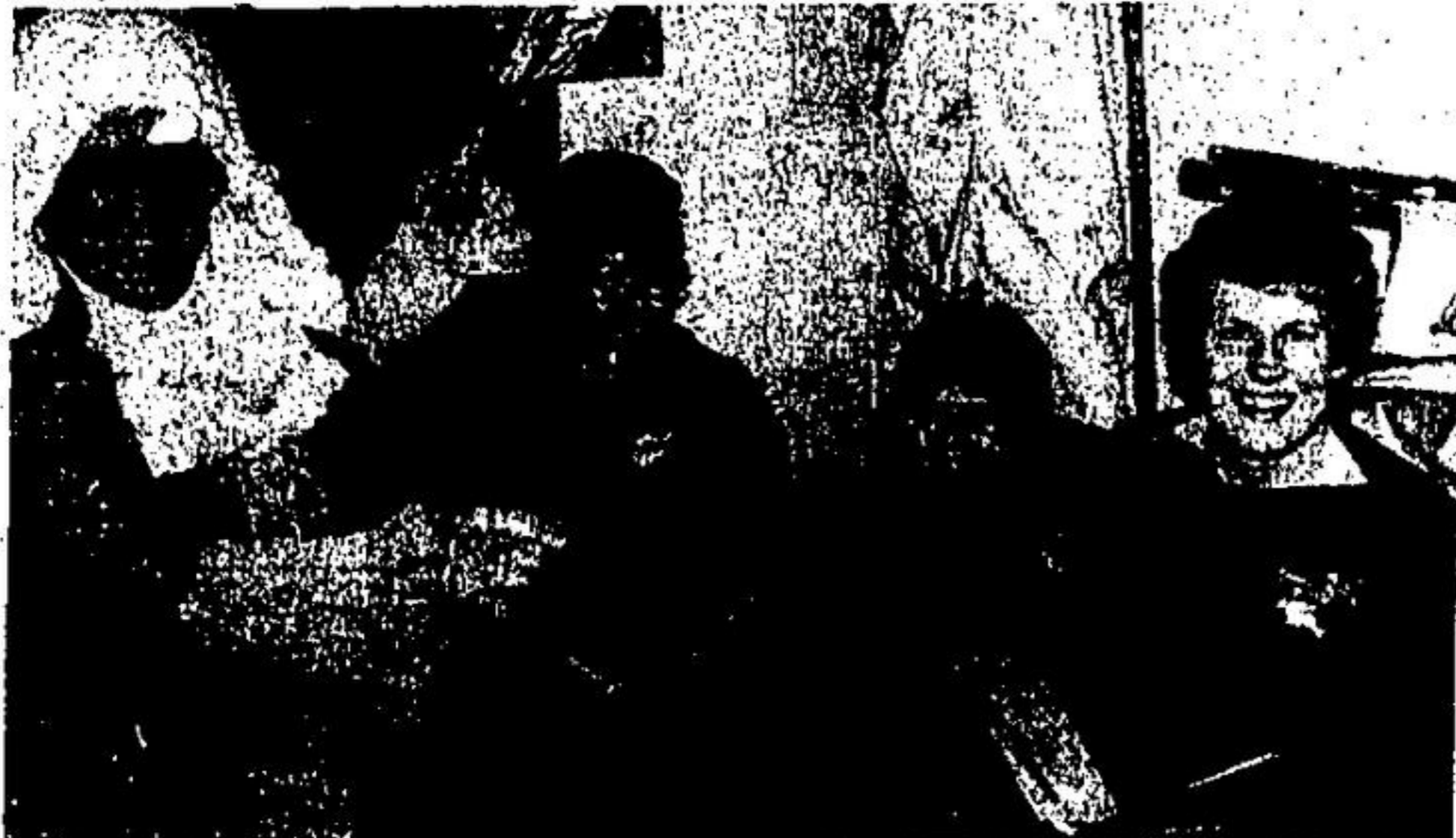
It's his 300th birthday, and J.S. Bach turned up Friday night to celebrate with the Georgetown Choral Society at Sacre Coeur hall. Getting into the

Don't miss a chance to see the fruits of all these people's efforts. Call for tickets at 877-4323 and enjoy the show!