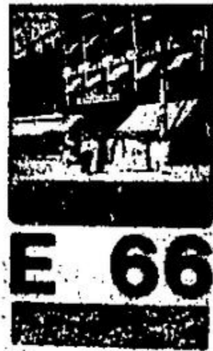
Pictures on door entrances indicate the individuality of each room. The plaques can be identified by the room number, the picture or the name plate.