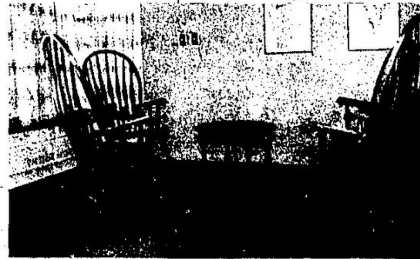
These beautiful wooden rockers occupy a corner of one of the sitting rooms. Couches and tables fill the rest of the room which is very spacious.