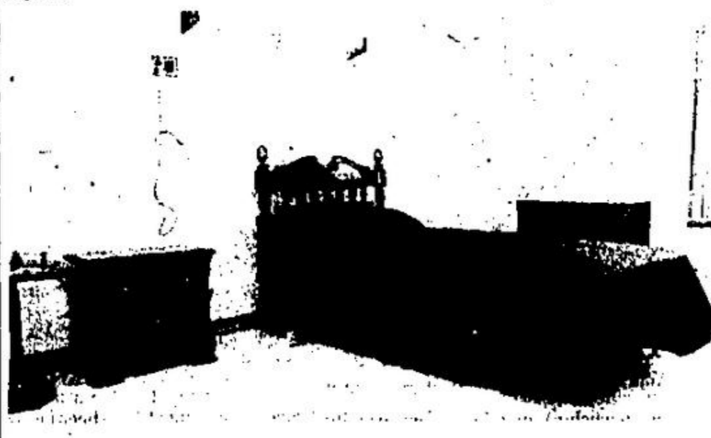
One of the private rooms in the complex, residents are invited to bring in their own items to further enhance their rooms.