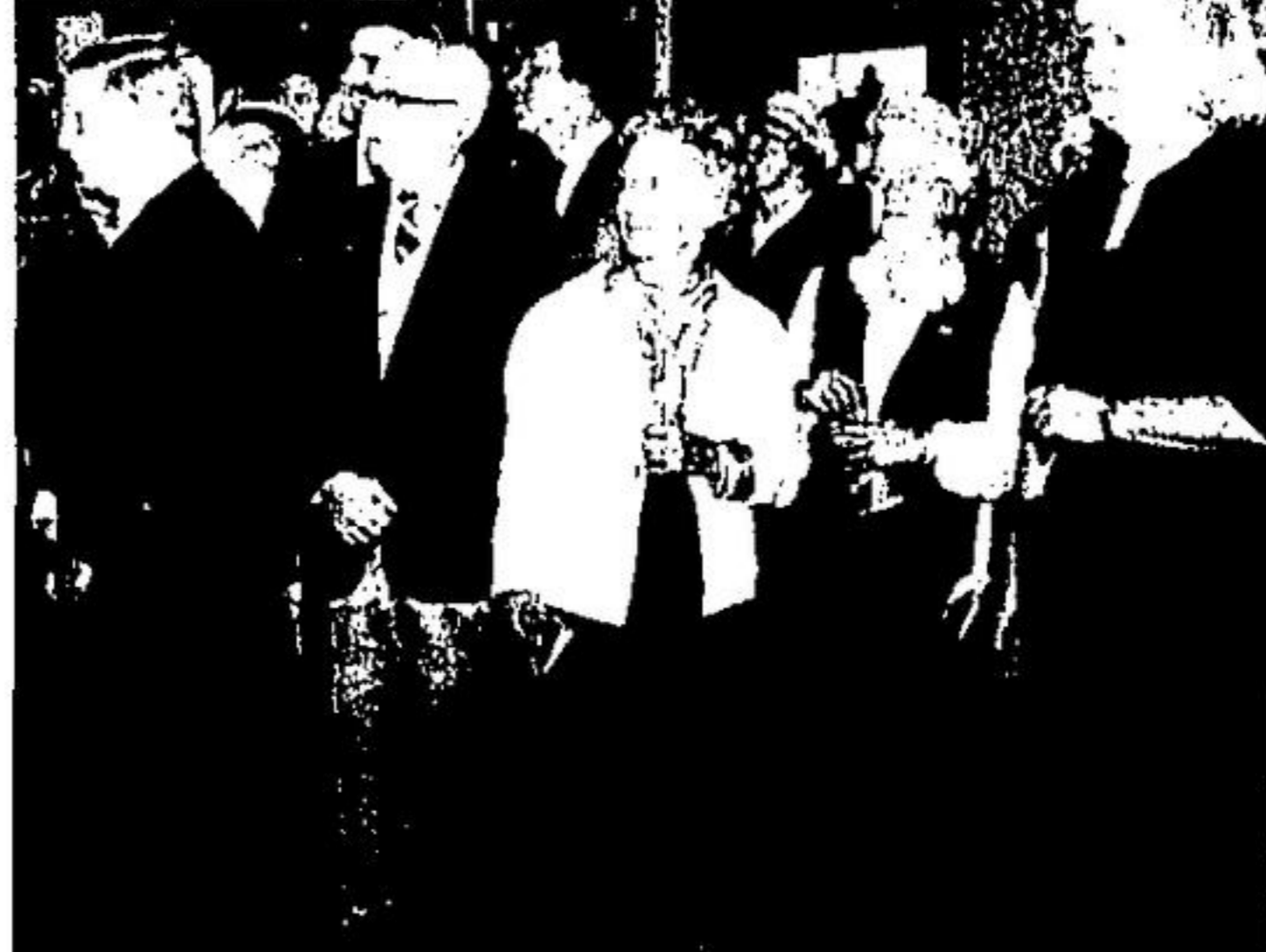
People lined the walls and corridors during the official opening of the Bennett Health Care Centre. Most had the opportunity to view the ceremonies but some had to do with just the audio.