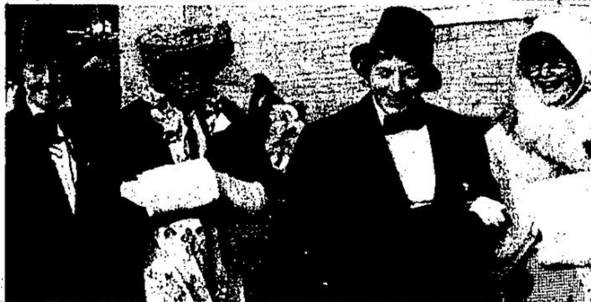
You didn't have to have a float to participate in the Santa Claus parade. These fashionably dressed people attracted some smiles for their out of date attire. Their dress was a fitting tribute to Georgetown's 120th anniversary as a town.