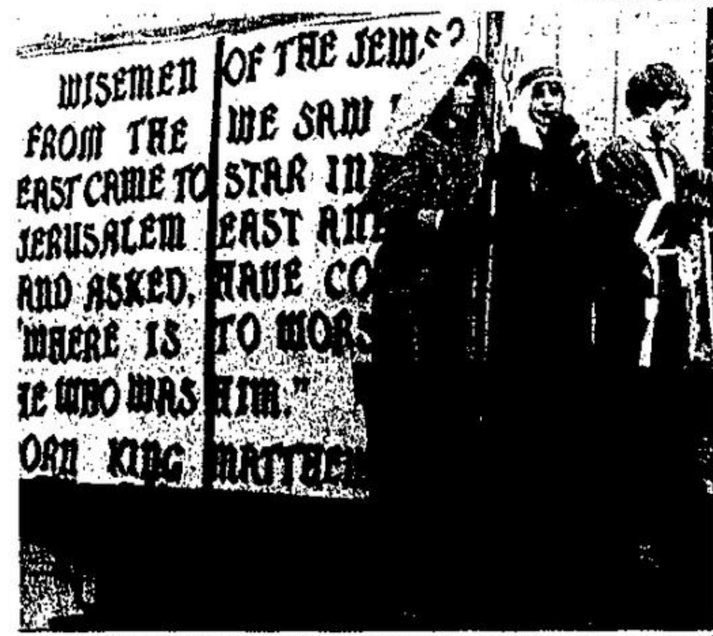
The Georgetown Christian School displayed some of the more meaningful Christmas scenes at the Santa Claus parade with a traditional view of Dec. 25.