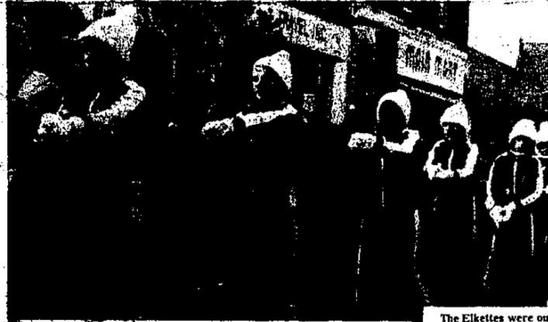
The Elkettes were out in full force, despite the chilling temperatures at the Santa Claus parade in Georgetown.