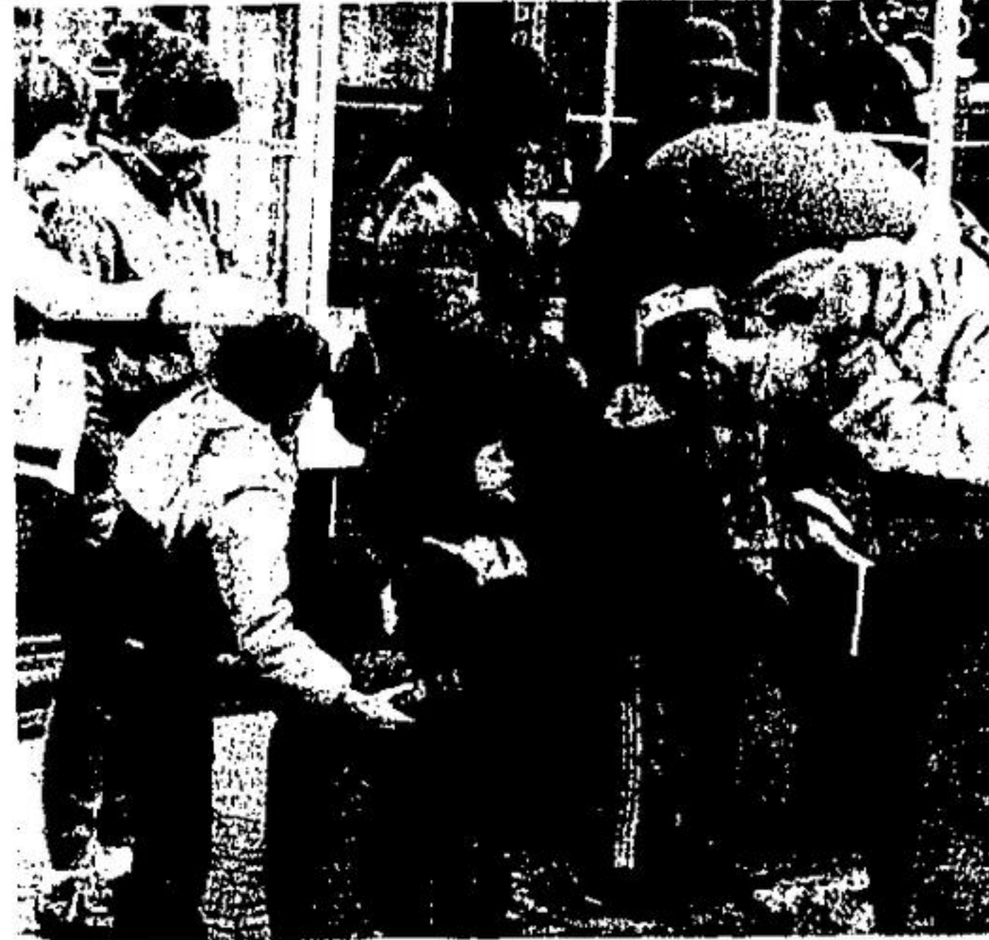
If you were a smurf fan, it was a good day to be out in Georgetown. Children had the opportunity to shake this smurf's hand during the Santa Claus parade Saturday.