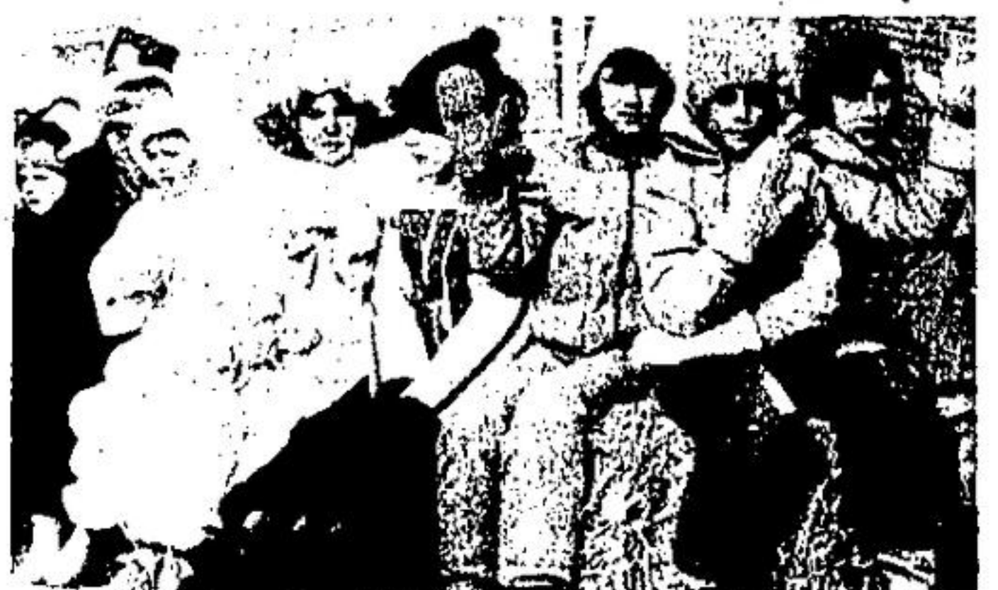
These girls were part of the Kinsmen Service Club Float.