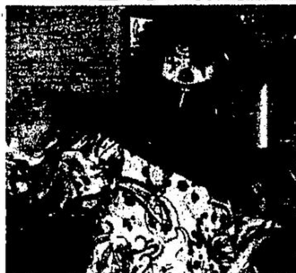
Clowning around was a favorite of parade participants.