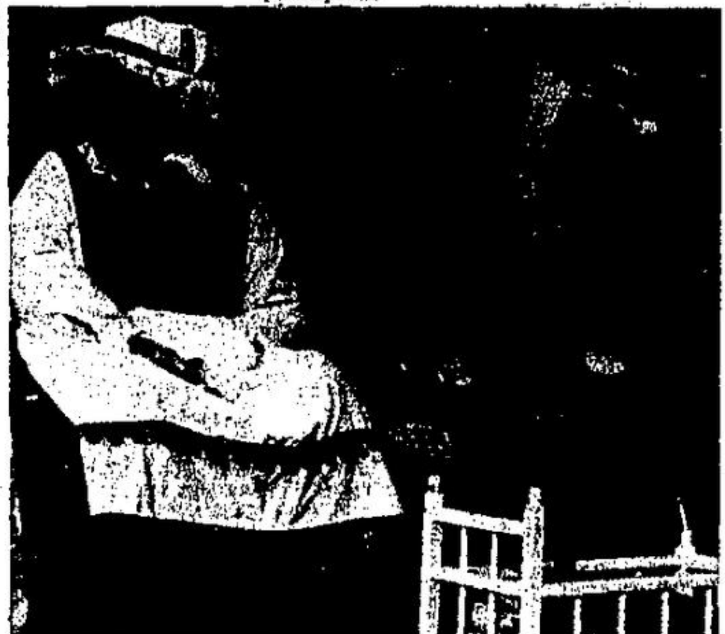
Mrs. Claus was a special guest at the Georgetown Santa Claus Parade. She was near a warm spot by the fireplace checking out stockings a family had left there.