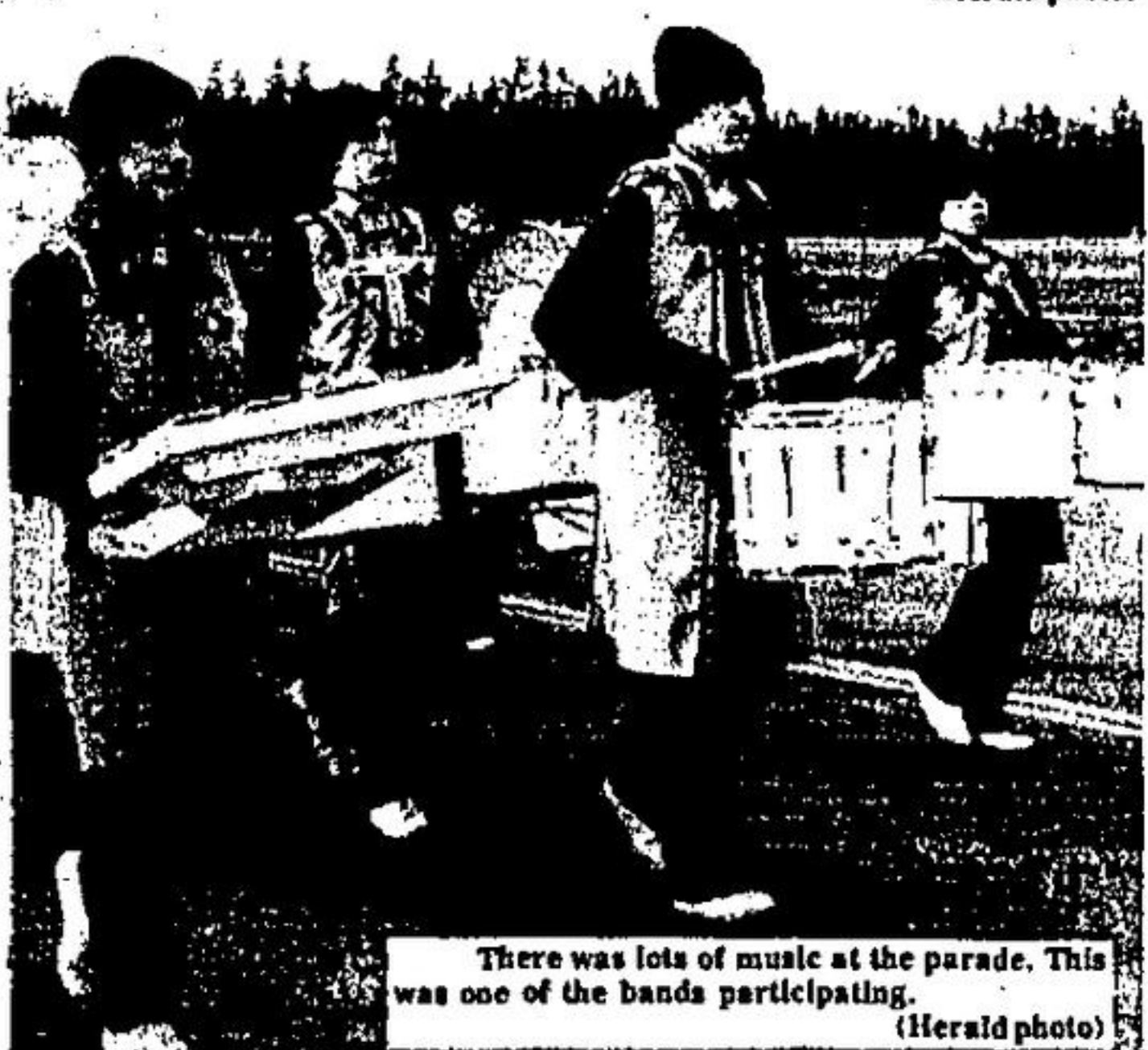
There was lots of music at the parade. This was one of the bands participating.