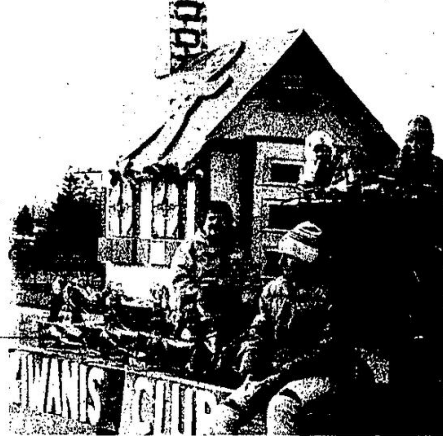
The Kiwanis Club float won a prize for the best participant in the service club category.