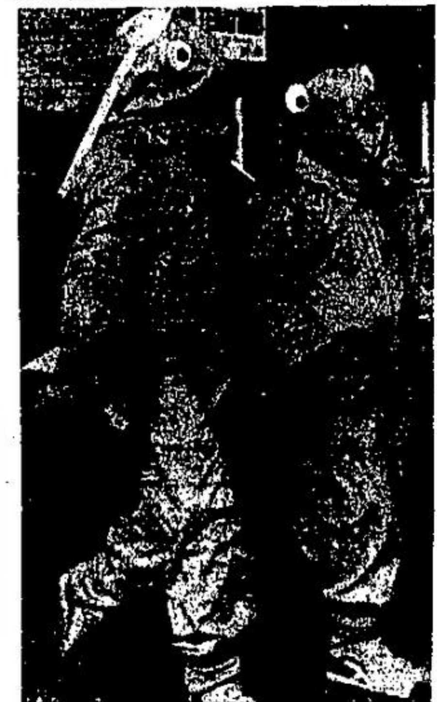
Today the pond, tomorrow the world. These swamp like creatures weren't the frightening type. They let everyone know they were friendly by waving and shaking hands.