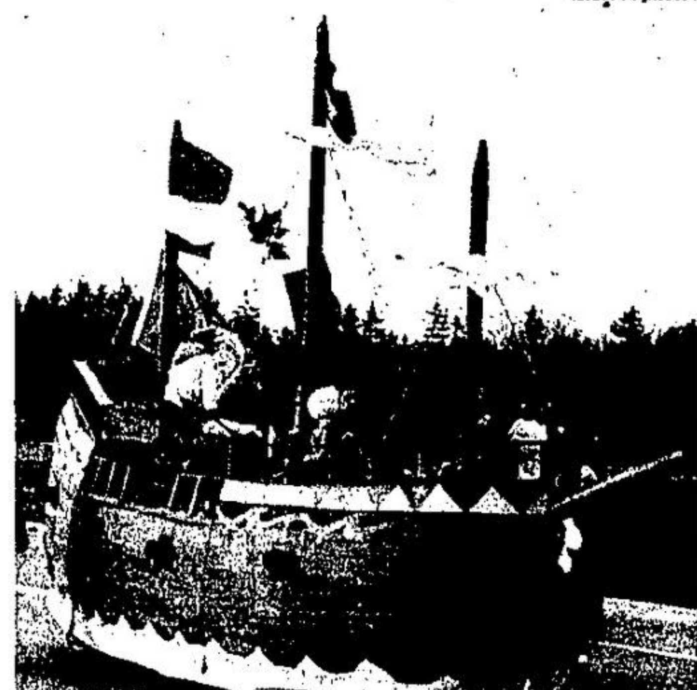
Ships Ahoy! Navigating the streets of Georgetown was this float that looked somewhat out of place, but it was a colorful and welcome addition to the parade. Maybe in the spring it will enter the Crazy Boat Race!