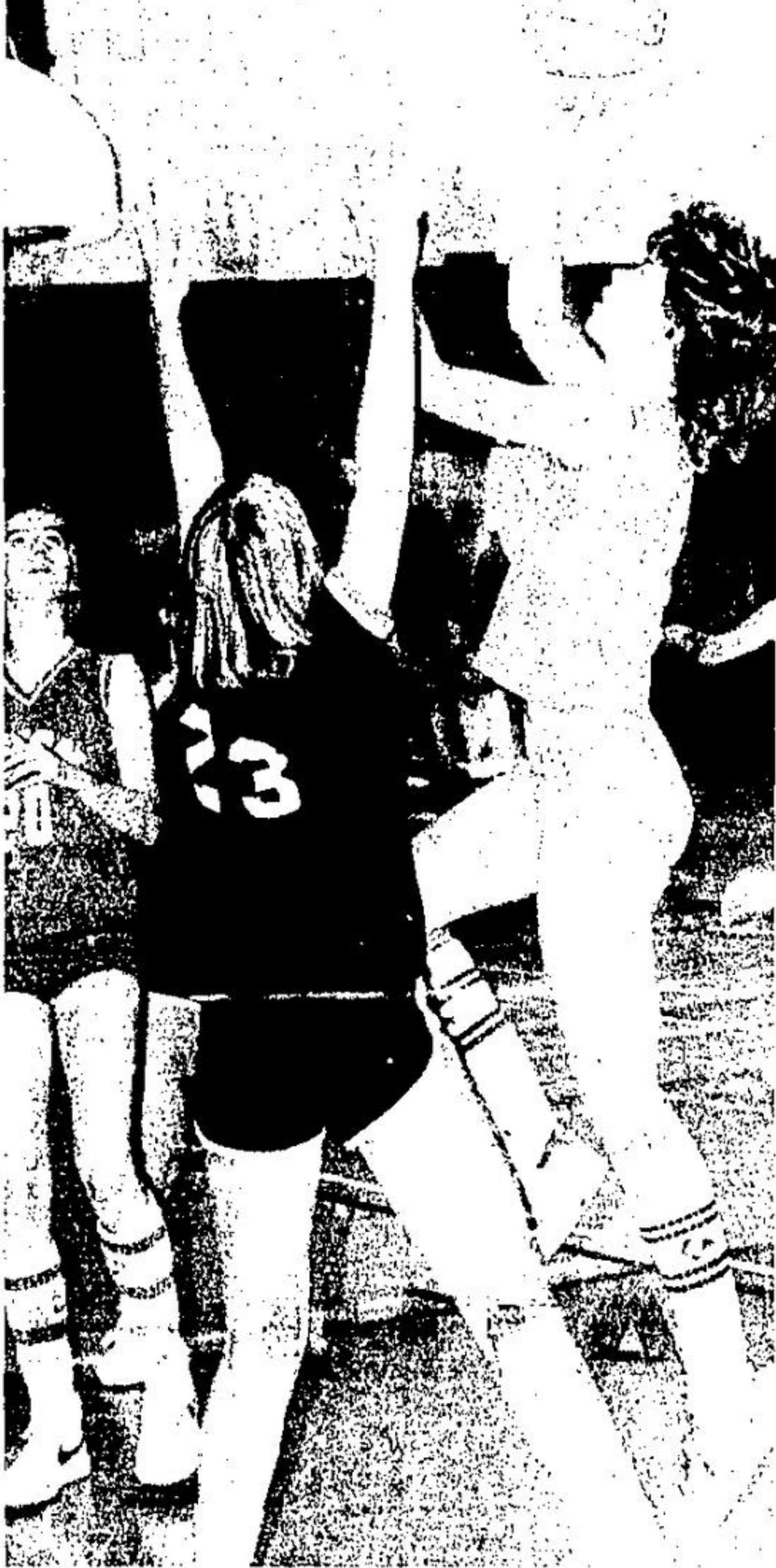
UP FOR TWO