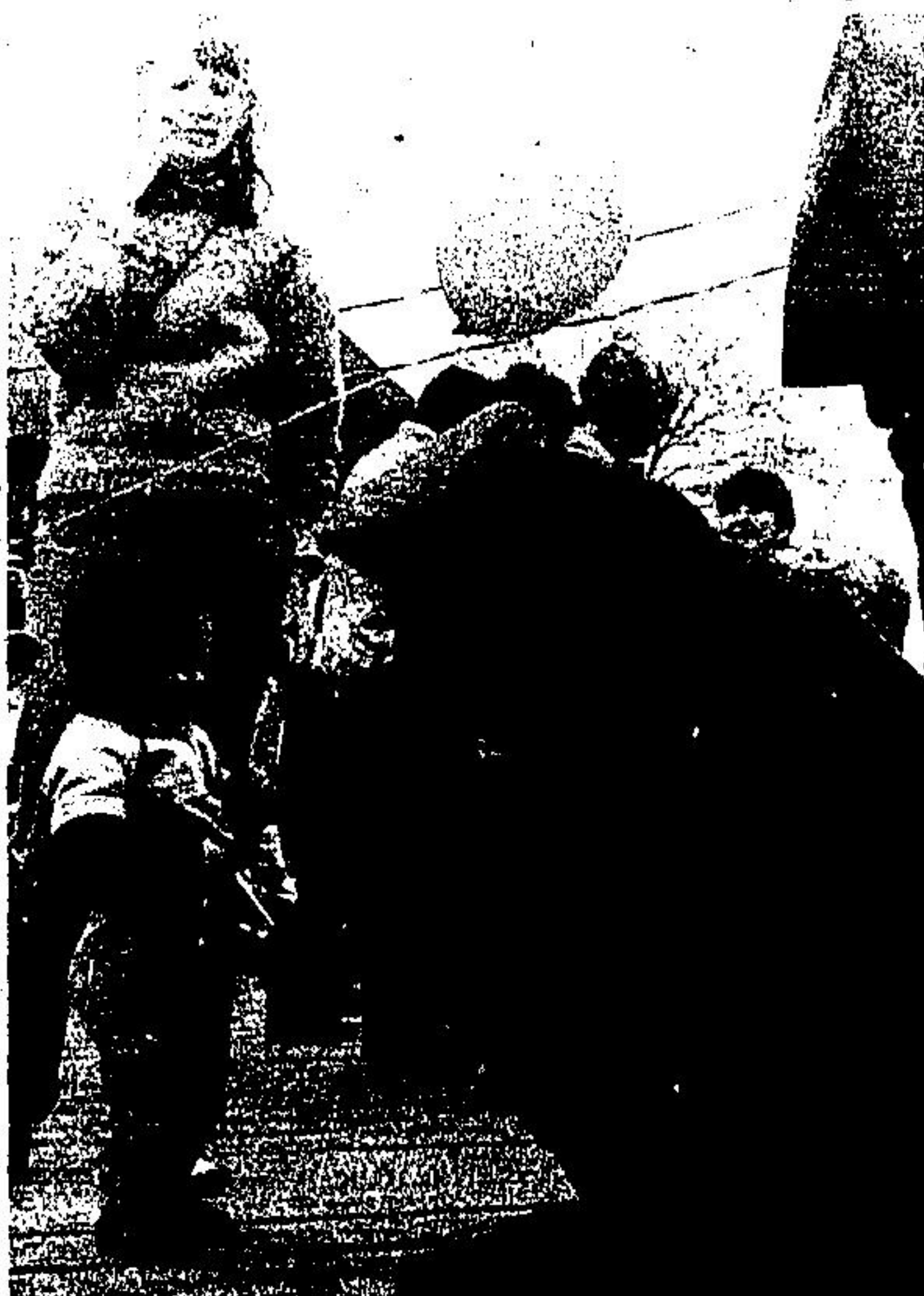
Barney the Beaver, safety mascot for the TTC, fascinated children on Sunday as part of Chudleigh's Apple Farm's Hallowe'en program. The activities at the farm were presented to kick-off the national UNICEF Hallowe'en fund raising campaign to benefit needy children around the world.